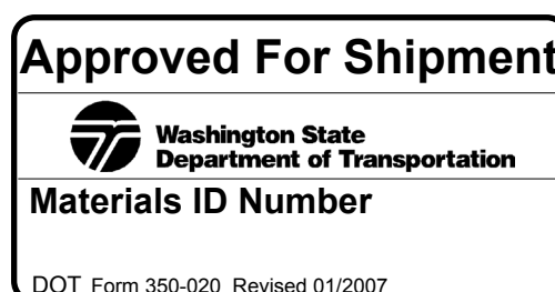
Figure 9-6 Tag

All documentation associated with the tag in Figure 9-6 will be reviewed and approved by the WSDOT Materials Fabrication Inspection Office and kept at the WSDOT Materials Fabrication Inspection Office and kept at the point of manufacture.