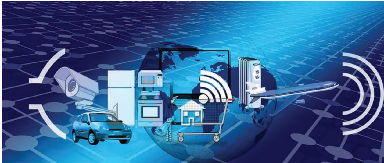
Figure 1.2: ICT Around Us

digital television. In addition to printed newspapers now we also have their electronic versions. Along with traditional radio, we also have online radio.