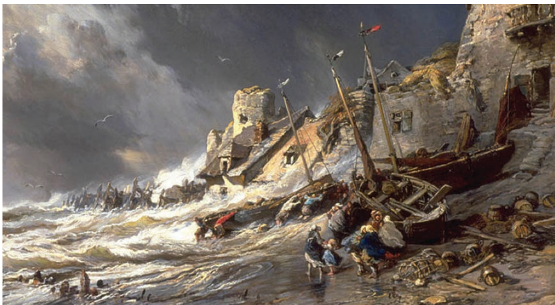
Figure 1.1: Coast Scene

Technology refers to methods, systems and devices, which are a result of scientific knowledge, being used for practical purposes. For example, Muskan went to an excursion to Bhubaneswar and visited the State Museum. She saw various mineral ores in the mineral section of the museum. She decided to capture photographs to share with others who may not have seen the ores. She borrowed her teacher's mobile and clicked pictures of the rare collection. She shared all the pictures on her blog along with a description of the ores. Many viewers commented and appreciated Muskan for sharing those pictures and description.