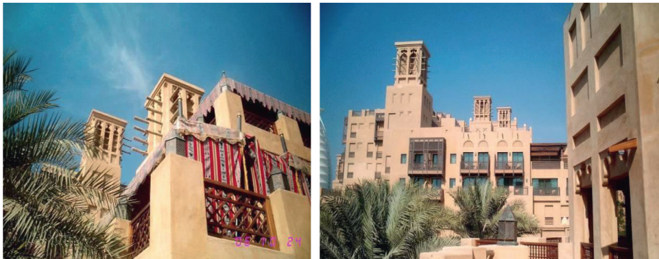
Figure 5. Inspiration from vernacular architecture within urban context.

The architecture of the region, created at specific geographic locations at certain points in time by different individuals, reflects spirit of identity. There is an interactive relation between sustainability and identity. Sustainability, in its comprehensive essence, has integrated within physical and incorporeal heritage of any society. Social and environmental sustainability has incorporated with local identity where people formed physical production (buildings, artifacts, furniture...) and cultural values (identity, traditions, social values...) in response to the ambient environment. Architectural identity, and its interrelation with the context such as location, climate, environment, local material, encloses the meaning of sustainability: “... sustainability is important part of the identity in architecture; identity is the main core in the dimension of regionalism architecture” [16].