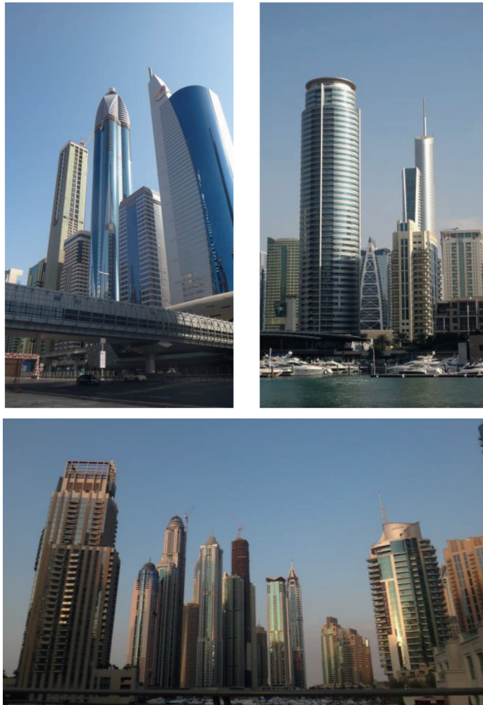
Figure 1. Modern high-rise buildings in Arab cities.

This chapter explores identity as an essence of architecture that goes beyond formal interpretation and visual metaphors through investigating sustainability potential of vernacular architecture in the Arab World.