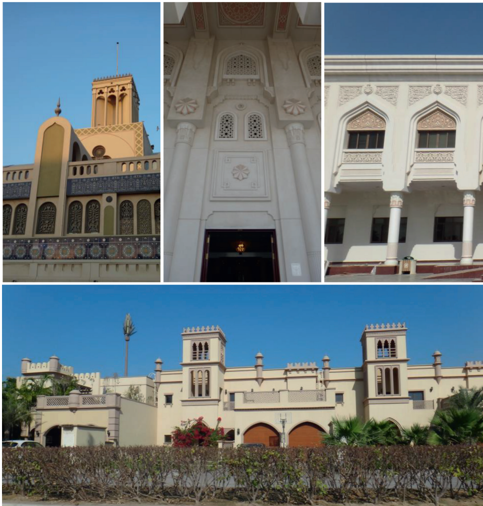
Figure 4. Modern buildings using traditional forms and architectural features.

In spite of the several demands by professionals, public, and suggested policies in 1970s and 1980s on the conservation of the traditional urban fabric of the Arab city, the traditional fabric was demolished, partially or completely in favor of Western building style as a trend to modernity. This was one of the actions leading to loss of modern architecture identity in the Arab World. The new urban planning strategies were set to accommodate the modern life vibrant style where grid-iron planning, big streets, cookie-cutter plots, new construction materials, and high-rise buildings replaced traditional fabric neglecting cities' architectural heritage and society's cultural values.