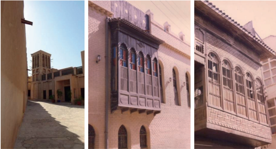
Figure 2. Aesthetical effect of shade and shadow in vernacular architecture (Source: Salman, Maha).

Arab countries have started to reexamine their own traditions in search of their “own” unique values and principles. This process had an impact on the production of contemporary architecture and eventually triggered an intense discussion about how “localism” should be created other than copying fragments from the past.