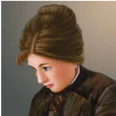
▲ Figure 1-5

The reign of Queen Victoria of England, between 1837 and 1901, was known as the Victorian Age. Fashions in dress and personal grooming were drastically influenced by the social mores of this austere and restrictive period in history. To preserve the health and beauty of the skin, women used beauty masks and packs made from honey, eggs, milk, oatmeal, fruits, vegetables, and other natural ingredients. Victorian women are said to have pinched their cheeks and bitten their lips to induce natural color rather than use cosmetics, such as rouge or lip color (Figure 1-5). LO1