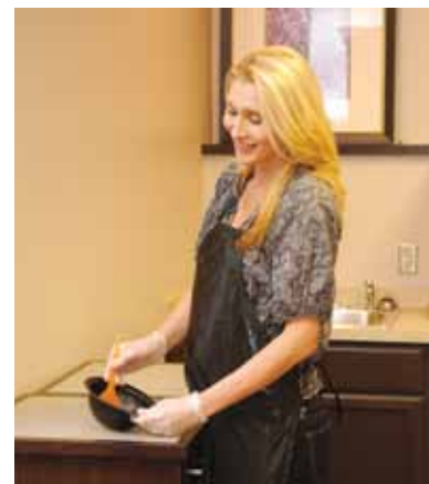
▲ Figure 1-10 Haircolor specialists are in great demand.