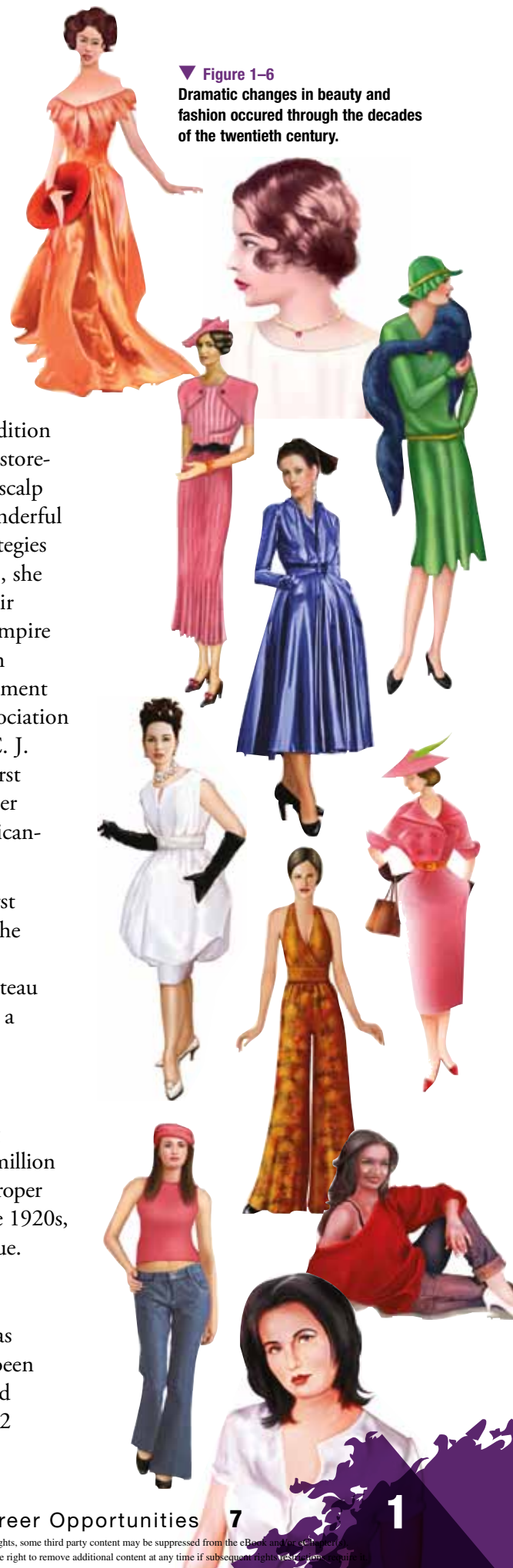
▼ Figure 1–6 Dramatic changes in beauty and fashion occurred through the decades of the twentieth century.

In 1931, the preheat-perm method was introduced. First, hair was wrapped using the croquignole method. Then, clamps that had been preheated by a separate electrical unit were placed over the wound curls. An alternative to the machine perm was introduced in 1932