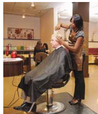
▲ Figure 1-11 Cutting hair in a salon is one of the many choices open to you.