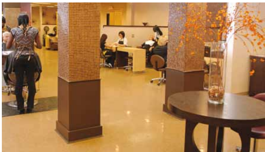
► Figure 1–12 A day spa may offer nail, hair, body, and skin services.

To learn more about the various types of salon business models, see Chapter 32, The Salon Business. There you will find a wealth of choices, including national and regional chains and low- and high-end salon opportunities.