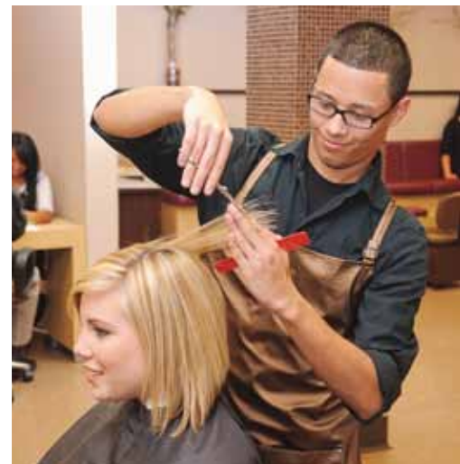
▲ Figure 1-8 Day spas are increasing in number and popularity.

Men-only specialty spas and barber spas have also grown in popularity. These spas provide exciting new opportunities for men's hair, nail, and skin-care specialists. Figure 1-9 on page 10 is a timeline of significant events in the cosmetology industry. LO2