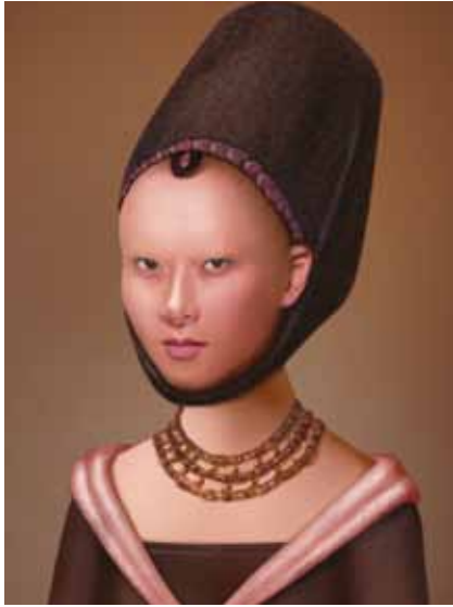
▲ Figure 1-4

During the Renaissance, shaving or tweezing of the eyebrows and hairline to show a greater expanse of the forehead was thought to make women appear more intelligent.