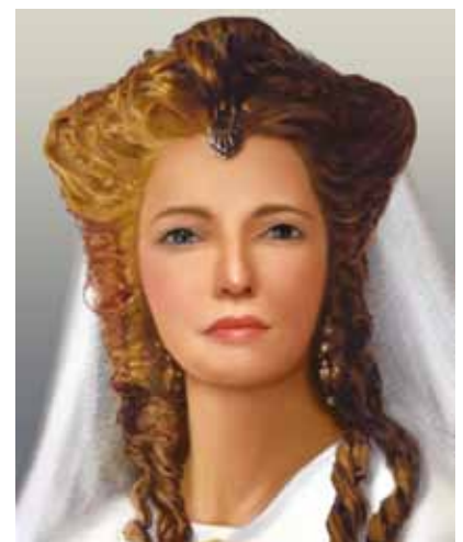
▲ Figure 1–2 The Greeks advanced grooming and skin care.