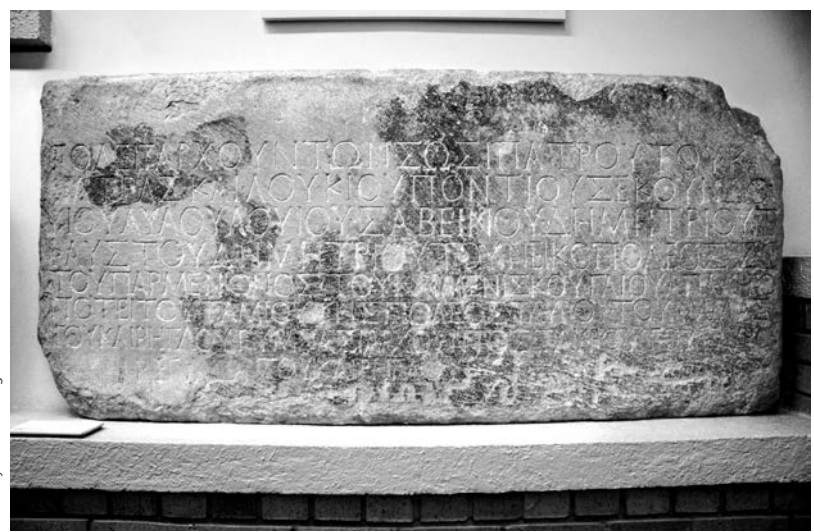
Luke uses a unique term, politarchēs [4173], for the rulers of Thessalonica, a word which appears only in Acts 17:6, 8. In 1877 an inscription (pictured here) was discovered in excavations of ancient Thessalonica that used this same term in reference to the city rulers.<sup>3</sup>

At that point, something unexpected happened. At night, Paul received a vision instructing him to cross the sea into Macedonia and to preach the gospel there (Acts 16:9-10). Sailing from Troas and through Neapolis, they reached the city of Philippi, where the Lord softened the hearts of many to accept the gospel of Jesus Christ (Acts 16:11-15). However, in Philippi the closed, hardened hearts of spiritual opponents turned the city leaders against Paul and Silas, eventually leading to their arrest, beating, and imprisonment (Acts 16:16-24).