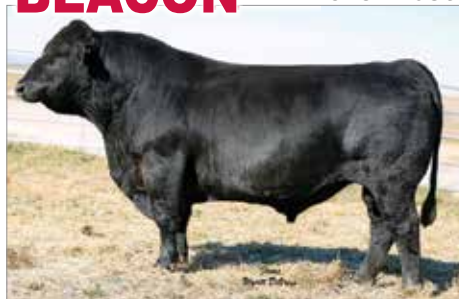
HOOK'S BEACON 56B