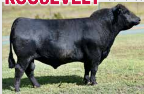
TJ ROOSEVELT 366E

Owned by Triangle J Ranch, NE; Gibbs Farms, AI; ABS Global, Inc., WI.