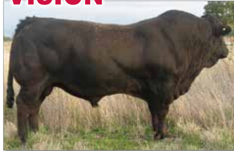
MANDAYEN VISION Y329 (HP) (B) (PN) (AA)