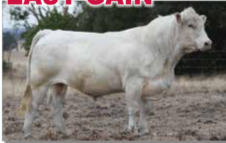
WELCOME SWALLOW EASY GAIN F508 (AI) (ET) (P)