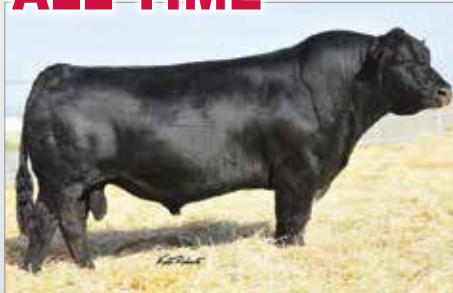
OVAL FALL TIME A322