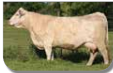
Grand dam - LT Unlimited Maid 7184 as a 10 y.o.