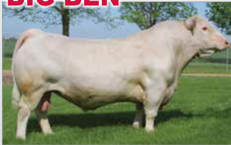
WC BIG BEN 9036 (P)