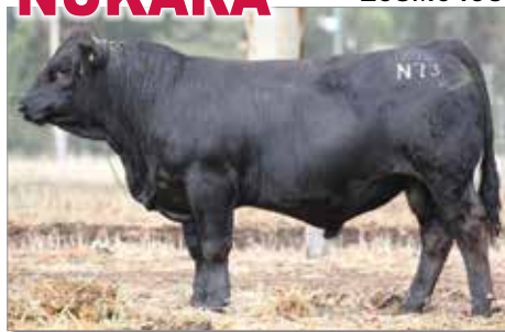
BONNYDALE NUKARA (P) (AI) (B)