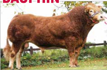
CARMORN DAUPHIN (PN) (AA)