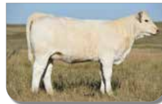
7228 - progeny