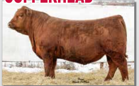
GW COPPERHEAD 919G