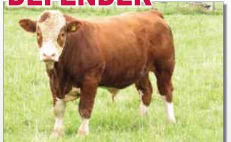
KERRAH DEFENDER D620