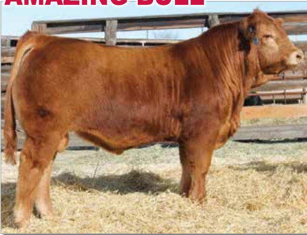
WULFS AMAZING BULL T341A (HP*) (PN) (AA)