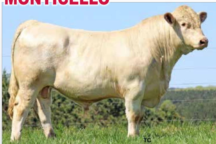
FTJ MONTICELLO 1806