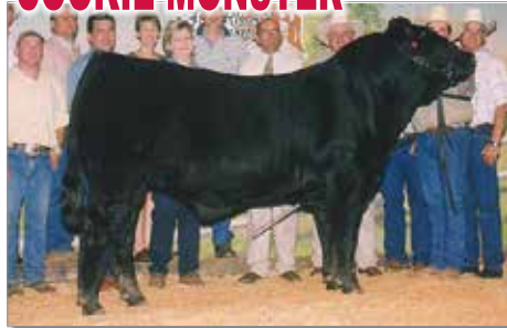
DFVC COOKIE MONSTER 108H (P) (B) (PN) (AA)