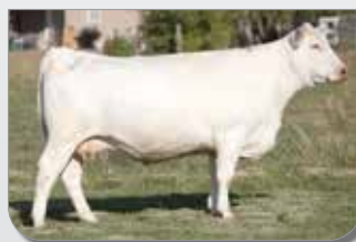
Dam LTBV Shandy1527