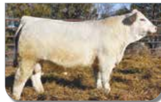
9455 - progeny