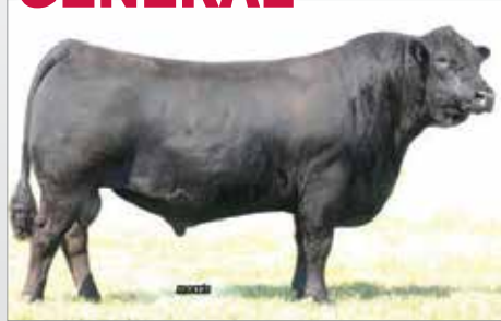
AUTO DOLLAR GENERAL 122R (HP*) (HB*) (PN) (CC)