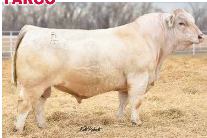
RBM FARGO Y111