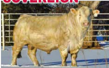
RAILE SOVEREIGN J827 Y064 (P)