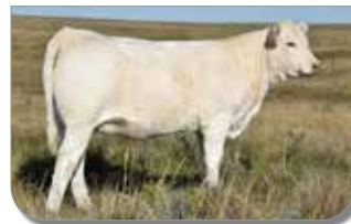
7065 - progeny