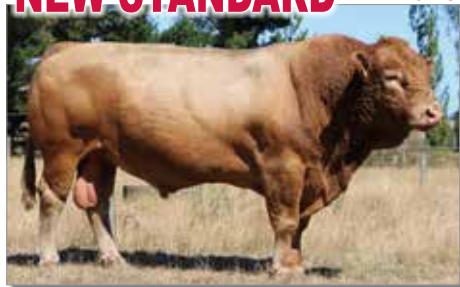
RISSINGTON NEW STANDARD AU158 (P)