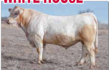
EATONS WHITE HOUSE 50148