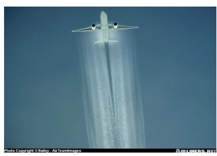
KSLA NEWS REPORTS DANGEROUSLY HIGH BARIUM LEVELS KSLA TV DEFIES MAINSTREAM MEDIA CHEMTRAIL NEWS BLACK OUT REPORTS POISONOUS LEVELS OF ATMOSPHERIC BARIUM