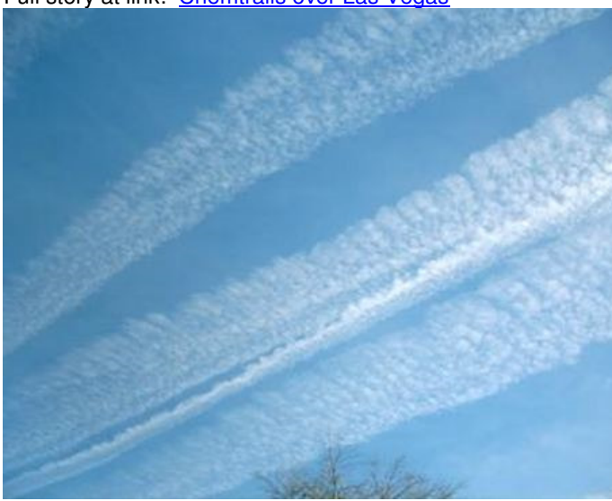
CHEMTRAILS OVER LAS VEGAS MEDIA STORY part 2 To view the entire article:

Thomas is convinced that we are under "deliberate biological attack" by agents known only to top military and government officials responsible for permitting continuing over-flights by unmarked spray aircraft."