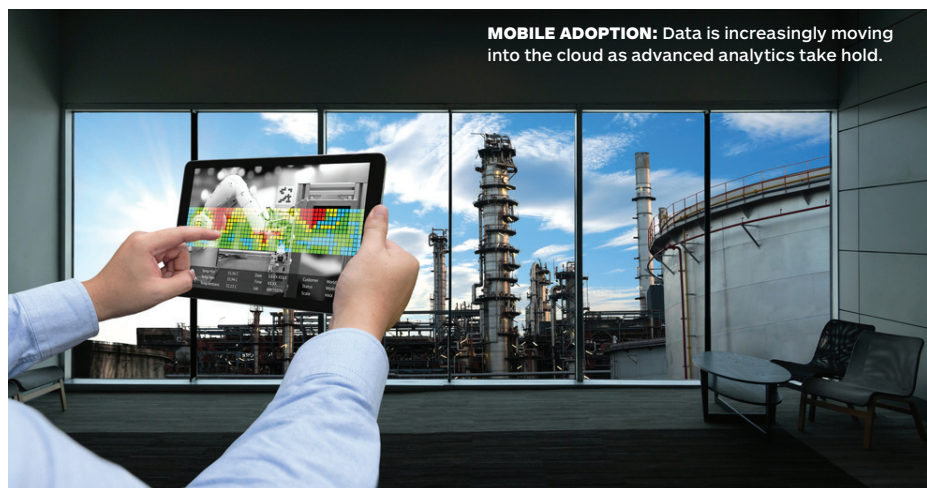
MOBILE ADOPTION: Data is increasingly moving into the cloud as advanced analytics take hold.