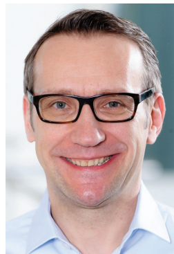
HAHN: Digital can transform products and processes.

estimated at more than a trillion dollars,” Schmitz says. “It’s clear, however, that not all companies will be able to capture all the opportunities from the levers. The scope for