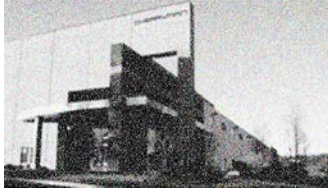
CHERRYMAN SouthEast Lithia Springs, Georgia