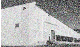
CHERRYMAN NorthEast South Brunswick, New Jersey