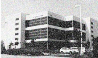
CHERRYMAN West | Headquarters Carson, California

Most Cherryman product is shipped in a Ready to Assemble state. Many of our storage units are shipped Pre Assembled.