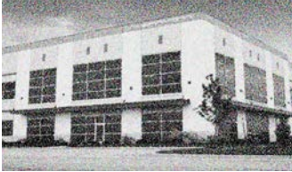
CHERRYMAN MidWest Greenfield, Indiana