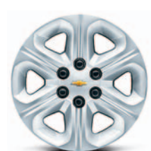
17" Steel Wheel with Painted Cover