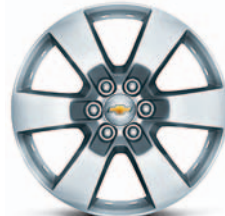
20" Aluminum Wheel