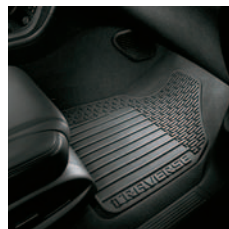
Premium All-Weather Floor Mats