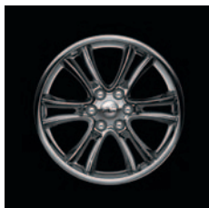
20" Chrome Wheel 4