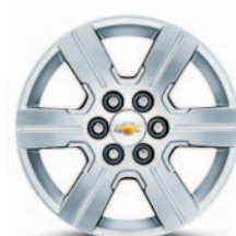
18" Machined-Aluminum Wheel