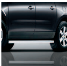
6" Chrome Oval Assist Steps

PERSONALIZE YOUR TRAVERSE AT CHEVY.COM/ACCESSORIES