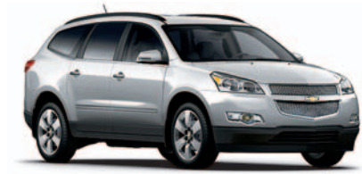
Silver Ice Metallic