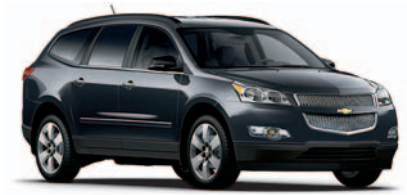
Black Granite Metallic 1,2