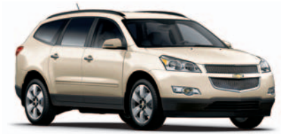
Gold Mist Metallic 2