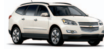
White Diamond Tricoat 1,2