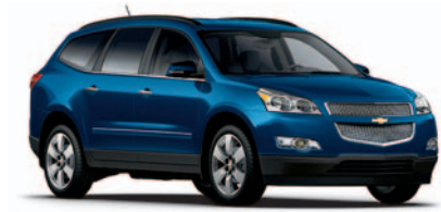
Dark Blue Metallic