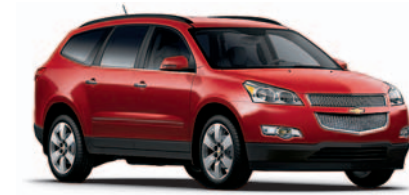
Crystal Red Tintcoat 1,2