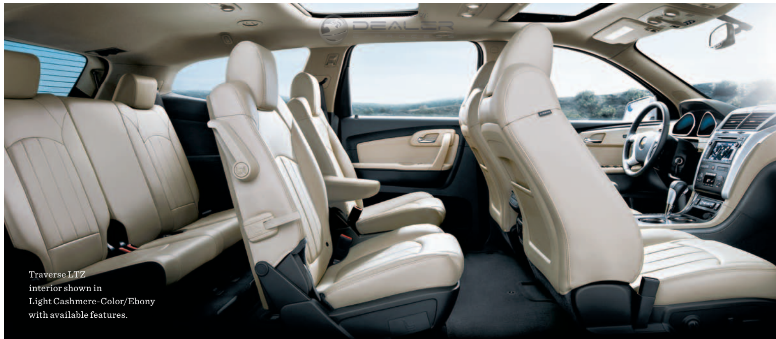
Traverse LTZ interior shown in Light Cashmere-Color/Ebony with available features.