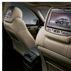
Dual Headrest DVD System