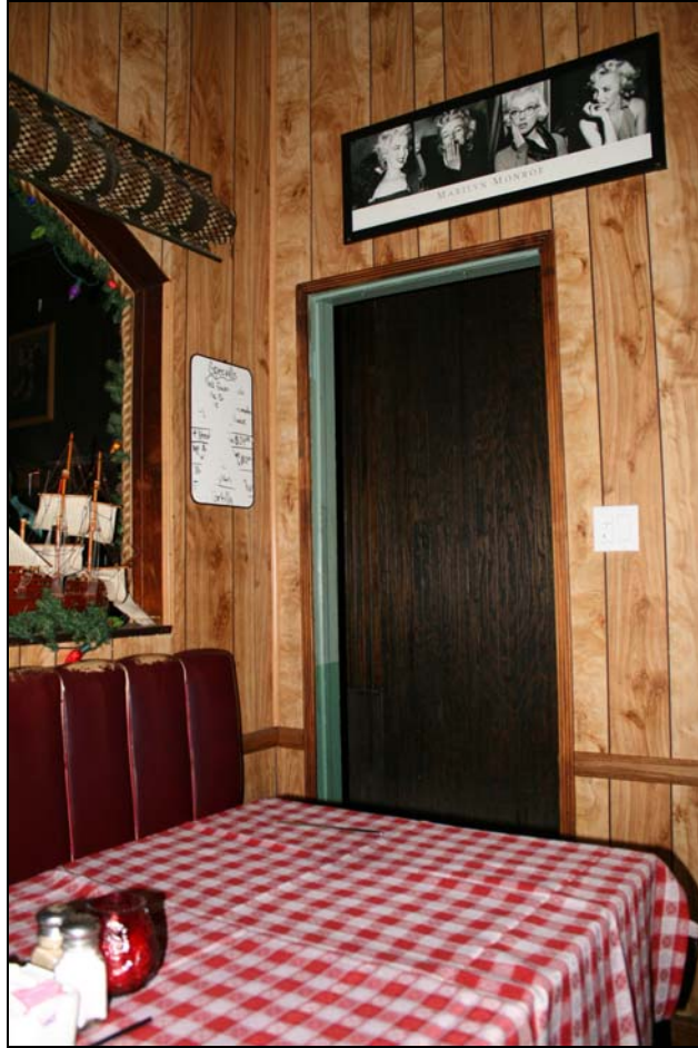
Table 10 looking towards corridor entry and cutout opening. Curtain hooks at door header remain.