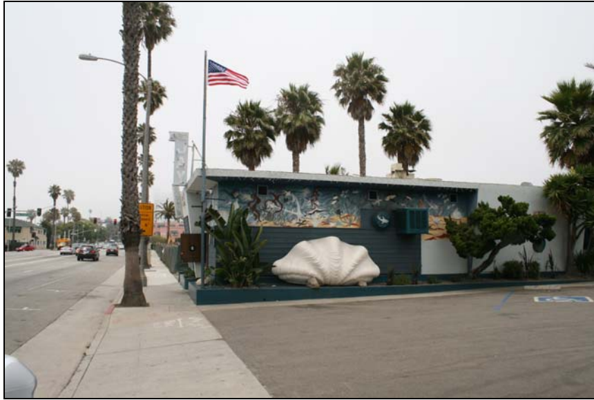
South elevation, looking north.