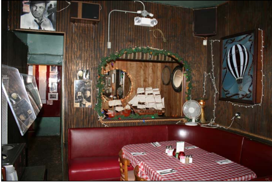
Rear of restaurant looking towards cutout opening of table 10. Restaurant portion ends through the corridor on left at back wall (with attached photos). Corridor also contains entrance to table 10.