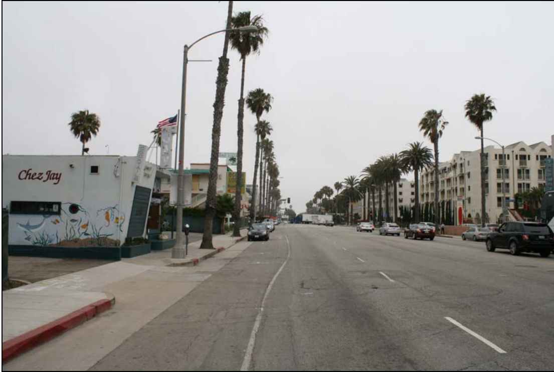
Context view, looking south from Ocean Avenue. Subject property is on the left.