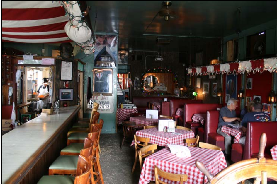
Interior, looking towards rear from front door.