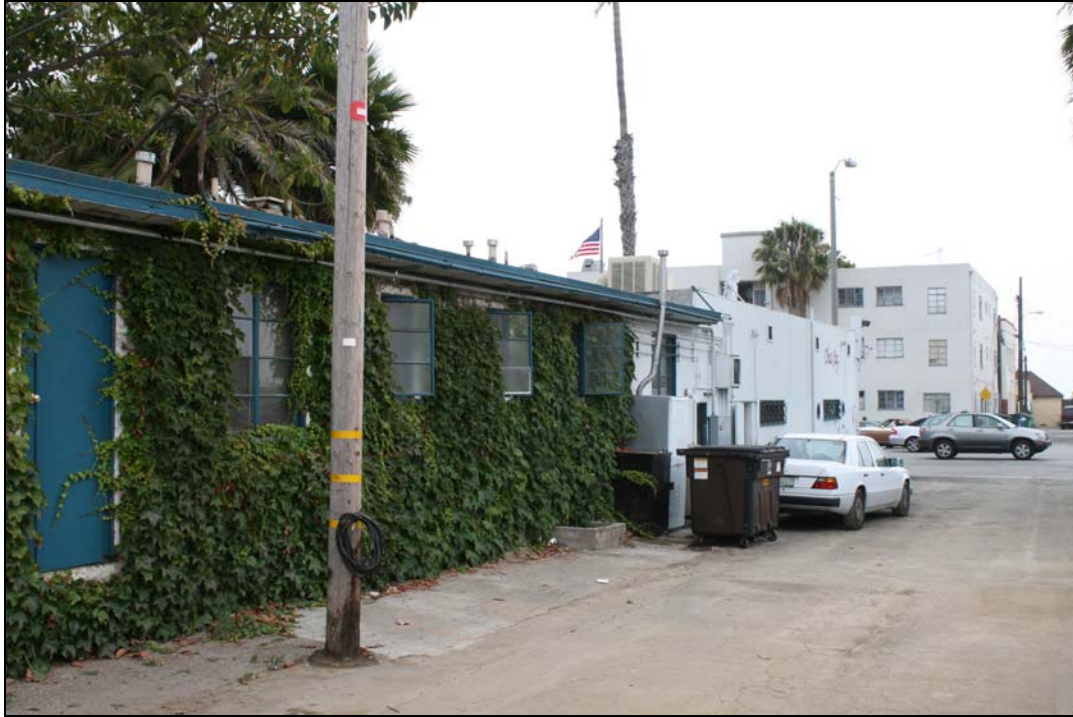
North elevation (former motel wing), looking southwest. Former motel portion ends where stepped up restaurant begins.