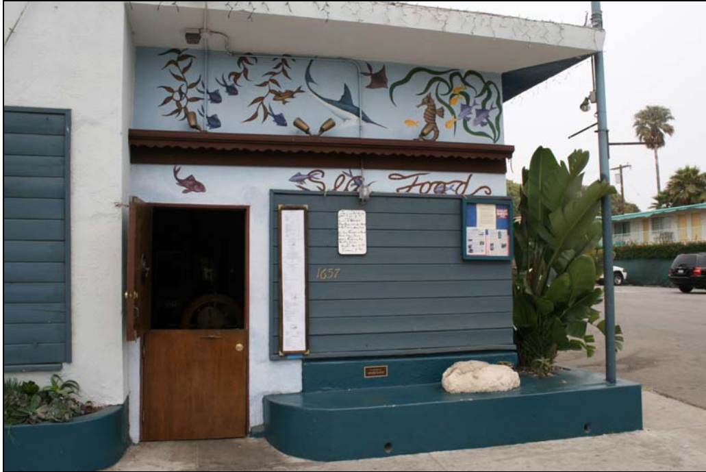
West elevation, looking southeast.