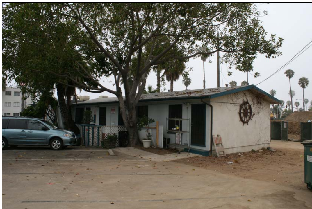
South and east elevations (former motel wing), looking northwest.