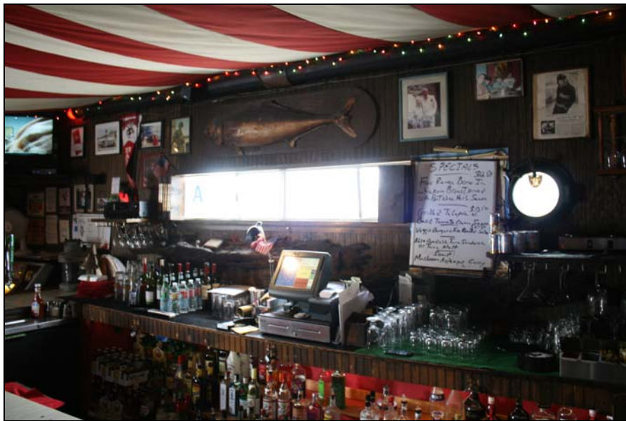
Back of bar.