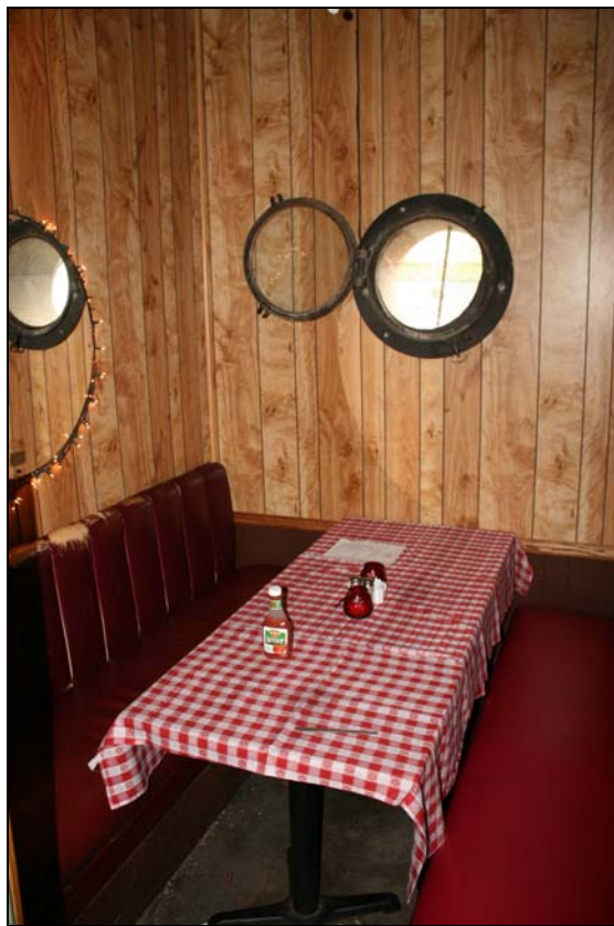
Table 10 with porthole detail and mirror (on left).