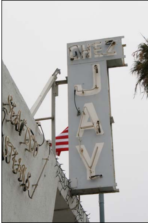
Original "Chez Jay" neon sign.