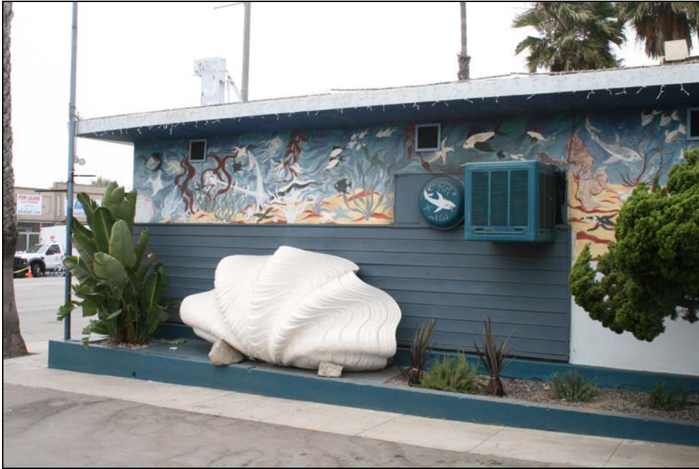
South elevation, looking northwest.