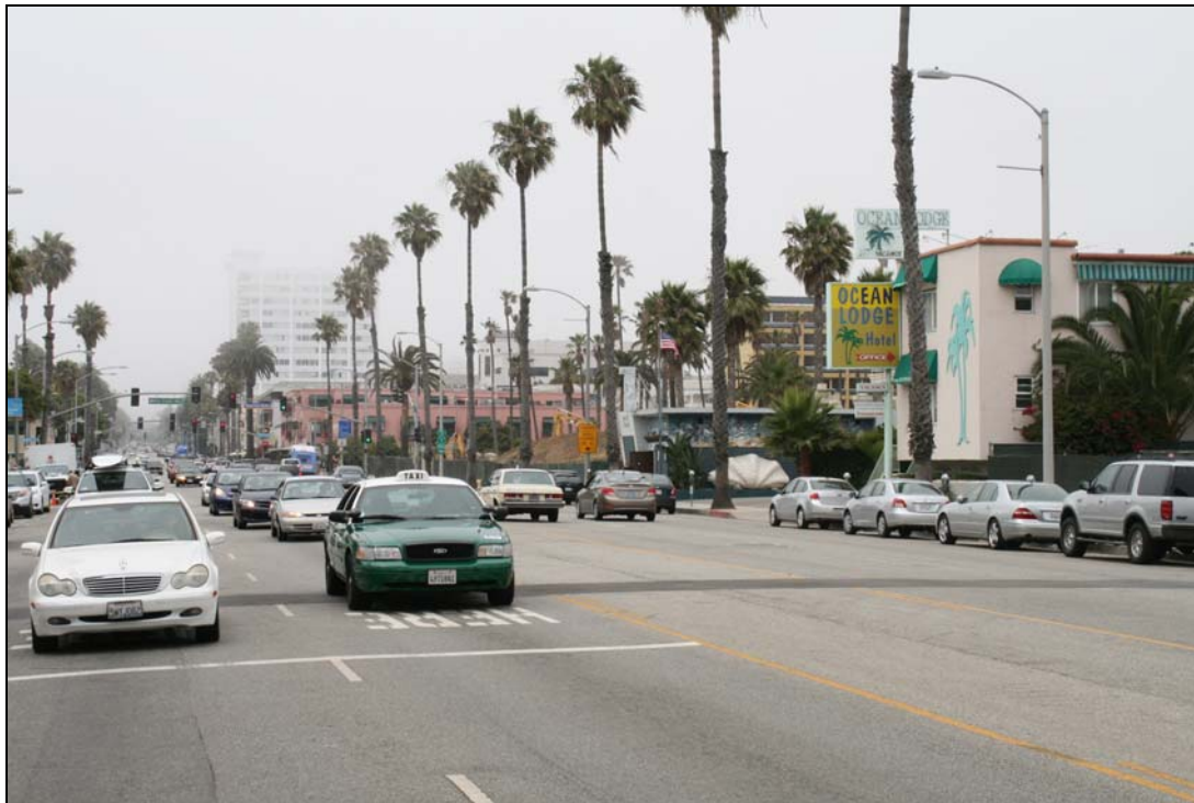
Context view, looking north from Ocean Avenue. Subject property is at the center right.