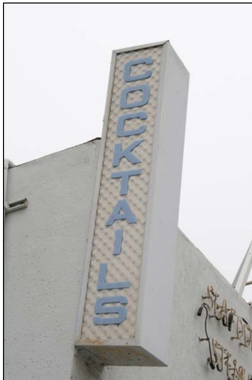
Original "Cocktails" plastic backlit sign.