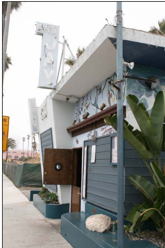
West elevation, looking northeast.