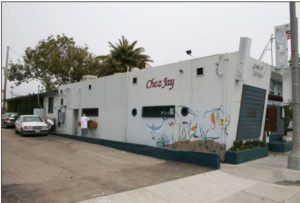
North and west elevations, looking southeast. Restaurant portion ends where stepped down roof begins.