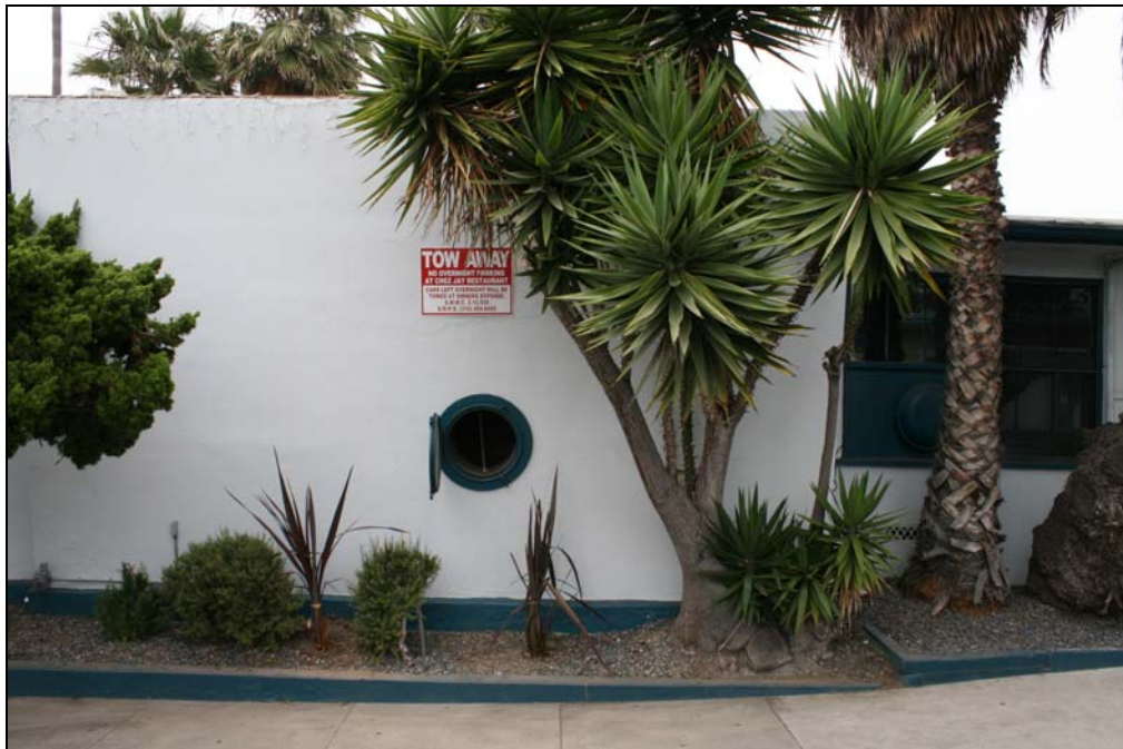
South elevation, looking north. Restaurant portion ends where recessed motel begins at right.