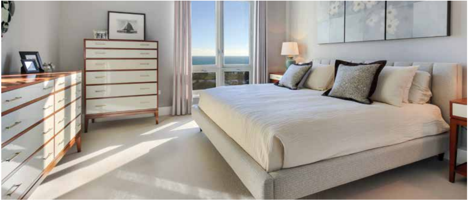
MASTER BEDROOM SUITE