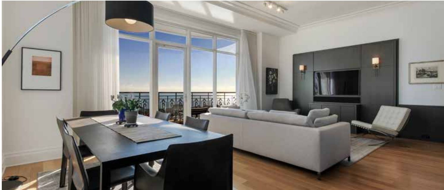
DINING ROOM/LIVING ROOM