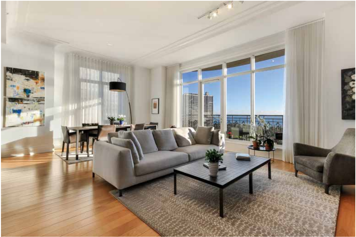
LIVING ROOM/DINING ROOM