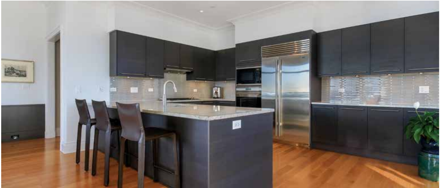
KITCHEN BREAKFAST BAR