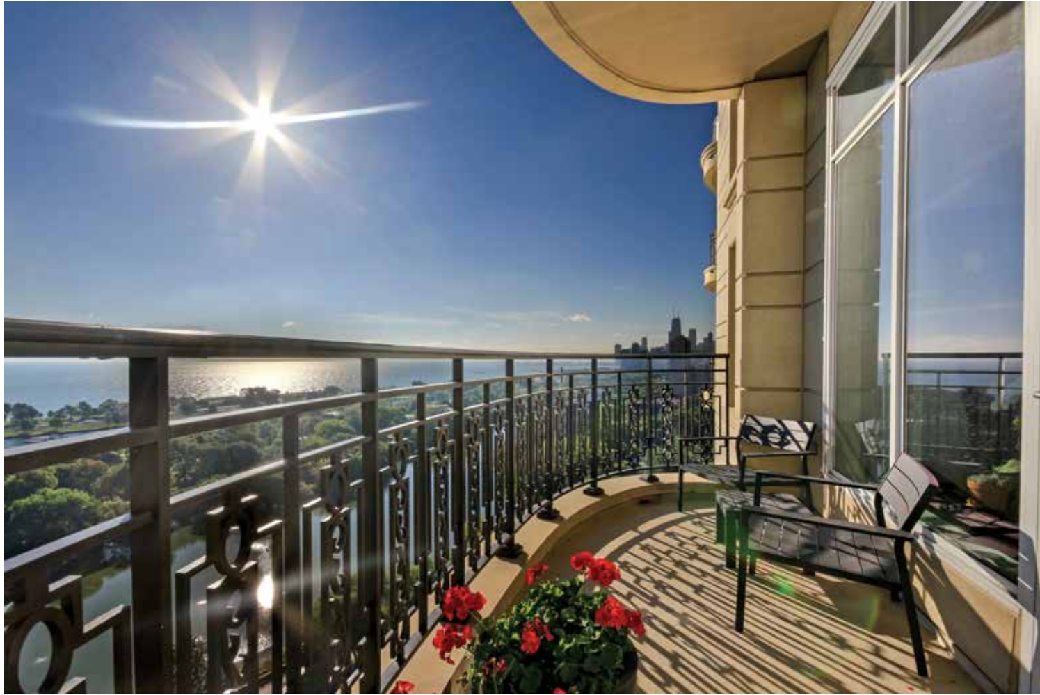
PRIVATE EAST TERRACE