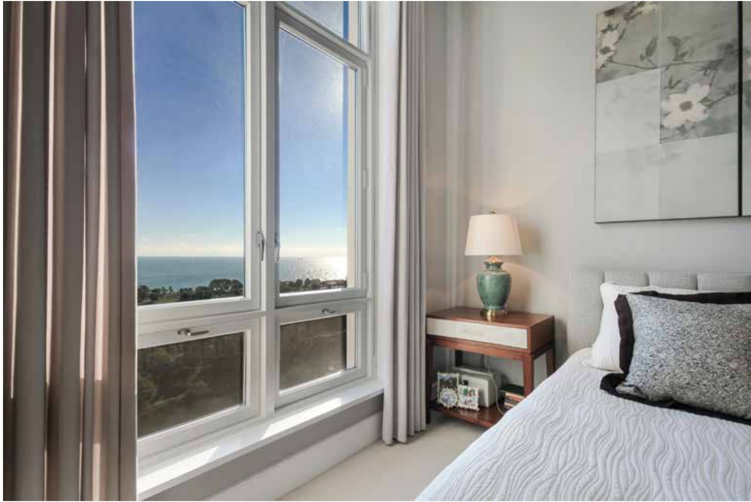
MASTER BEDROOM EAST VIEW