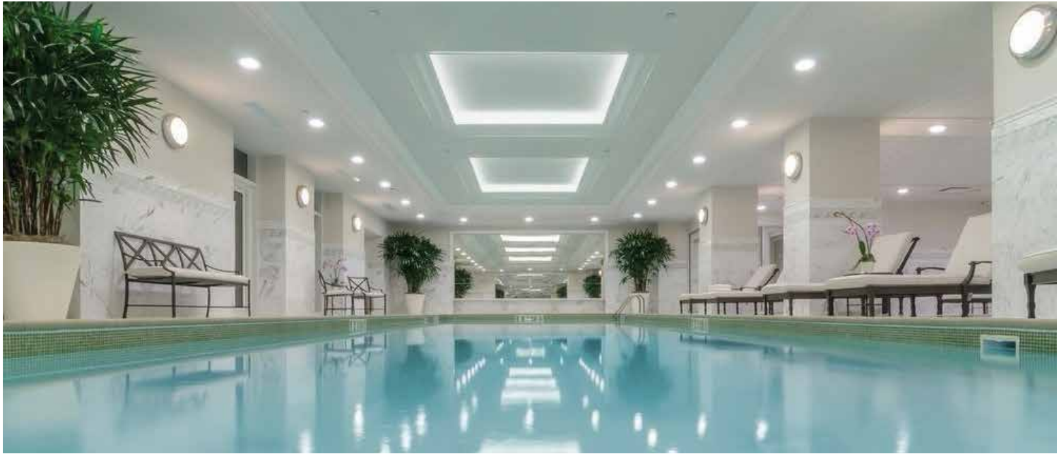
INDOOR POOL, WHIRLPOOL