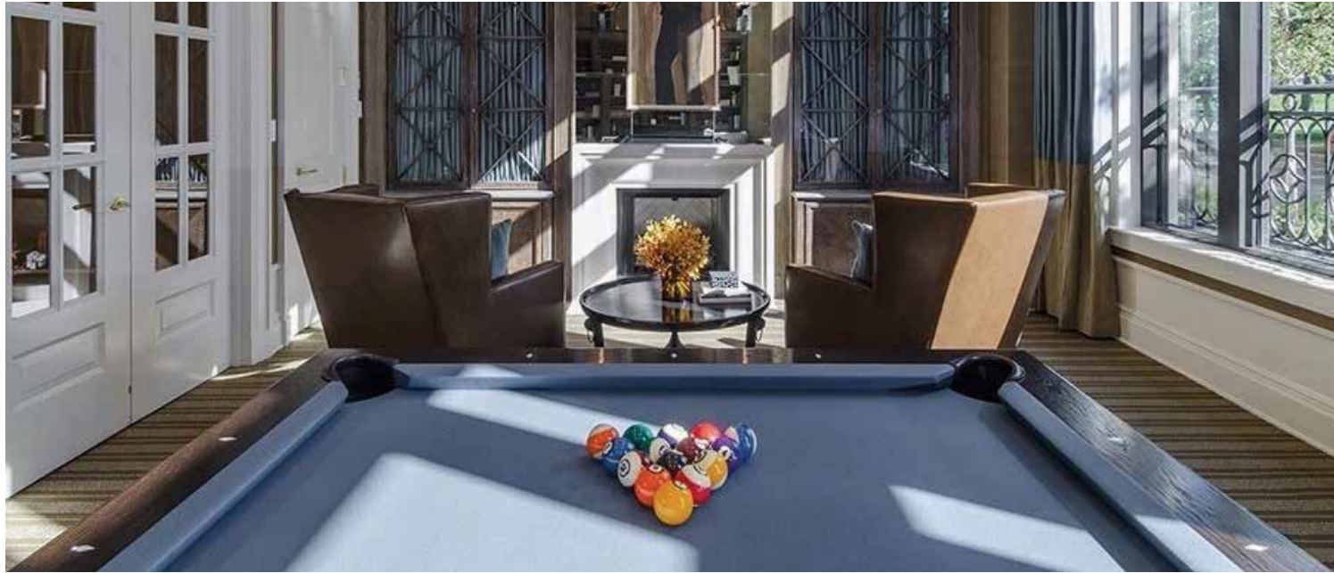
LIBRARY & BILLIARDS ROOM