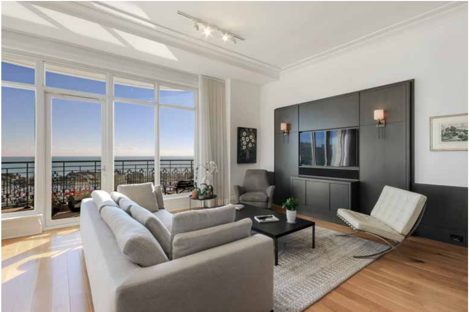
LIVING ROOM OPEN TO EAST TERRACE