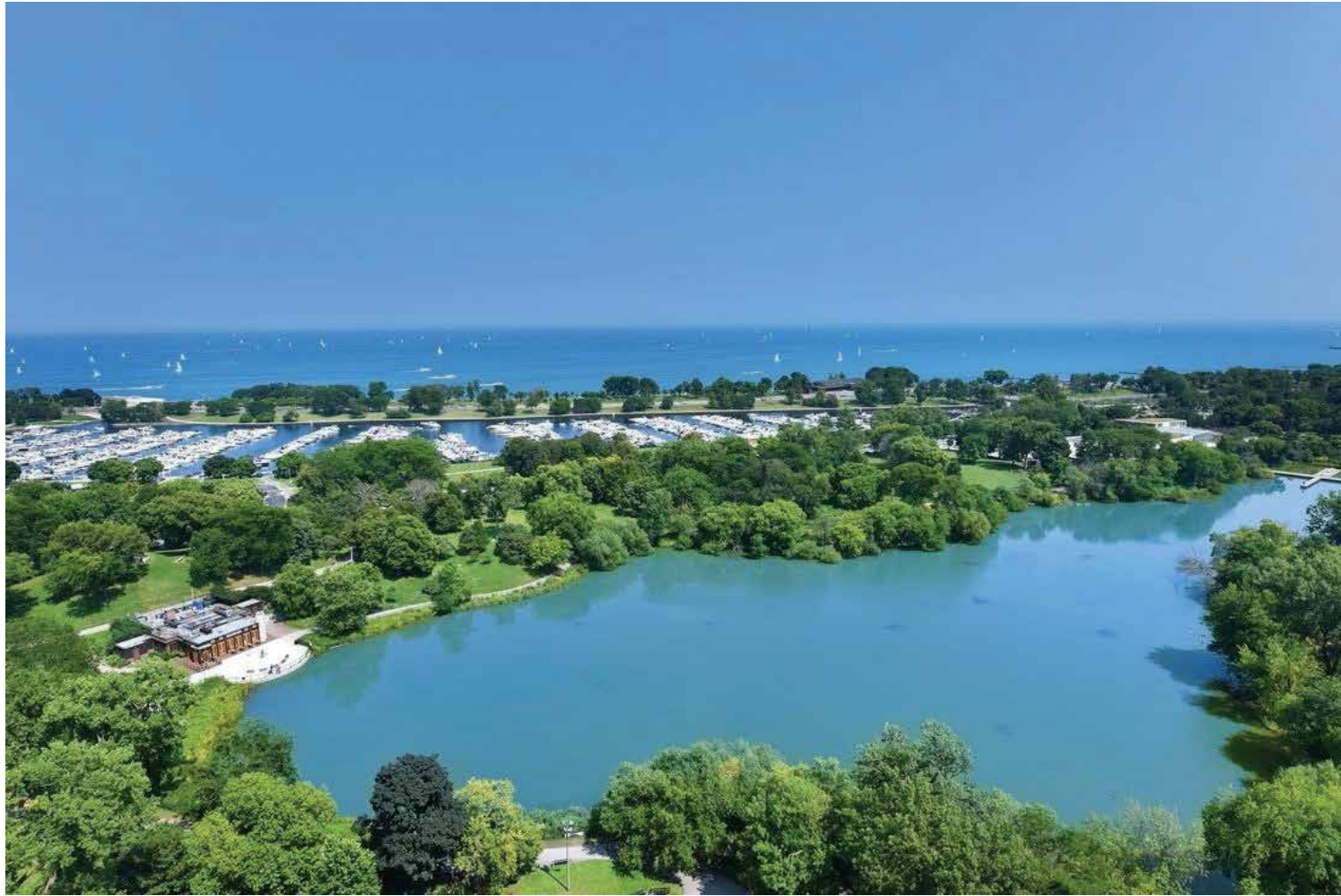
EAST VIEW FROM N1804