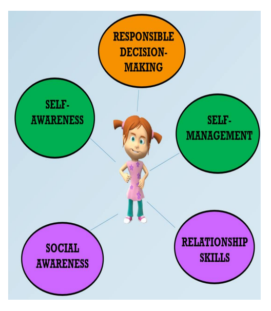
Five Competencies of SEL

"Social and emotional learning (SEL) is the process through which children and adults acquire and effectively apply the knowledge, attitudes, and skills necessary to understand and manage emotions, set and achieve positive goals, feel and show empathy for others, establish and maintain positive relationships, and make responsible decisions." — www.casel.org