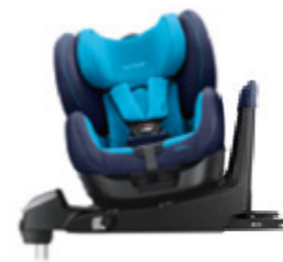
360° rotatable child seat for maximum comfort, with easy entry position