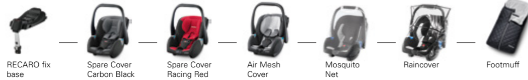
RECARO fix base Spare Cover Carbon Black Spare Cover Racing Red Air Mesh Cover Mosquito Net Raincover Footmuff