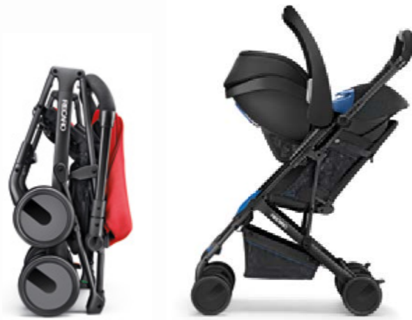
Compact folding size 49/58/26 (WxHxD)

The perfect companion for everyday family life. The colorful Easylife combines the flexibility of a buggy with all the comforts of a full-size stroller. The eight-wheeled, full suspension stroller with a practical one-hand folding mechanism folds to the most compact dimensions and fits into the smallest spaces.