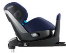
Reboard: safe rearward travelling up to 105 cm

Height adjustable headrest with memory foam