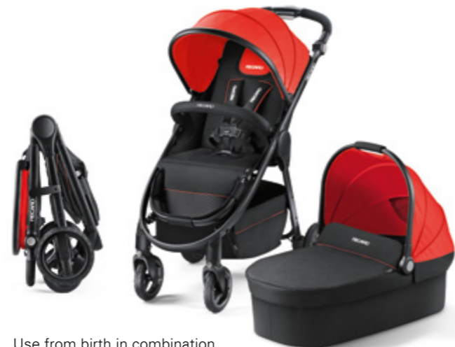
Use from birth in combination with the carrycot

Suitable for children from birth* - up to approx. 17.5 kg*