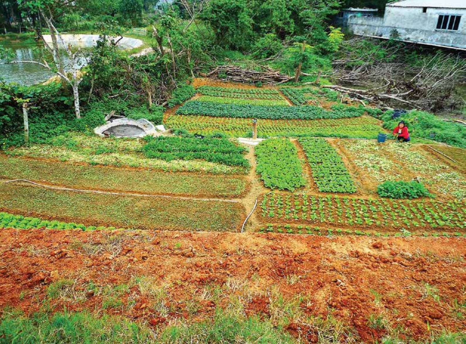
A small vegetable farm in rural Hainan Province. Agriculture was once the backbone of China's economy. Now it makes up only 9 per cent of GDP but accounts for more than 1/3 of the work force—about 300 million people—engaged in agricultural pursuits.

state-controlled production and with broad macroeconomic surveillance exercised by the central state.