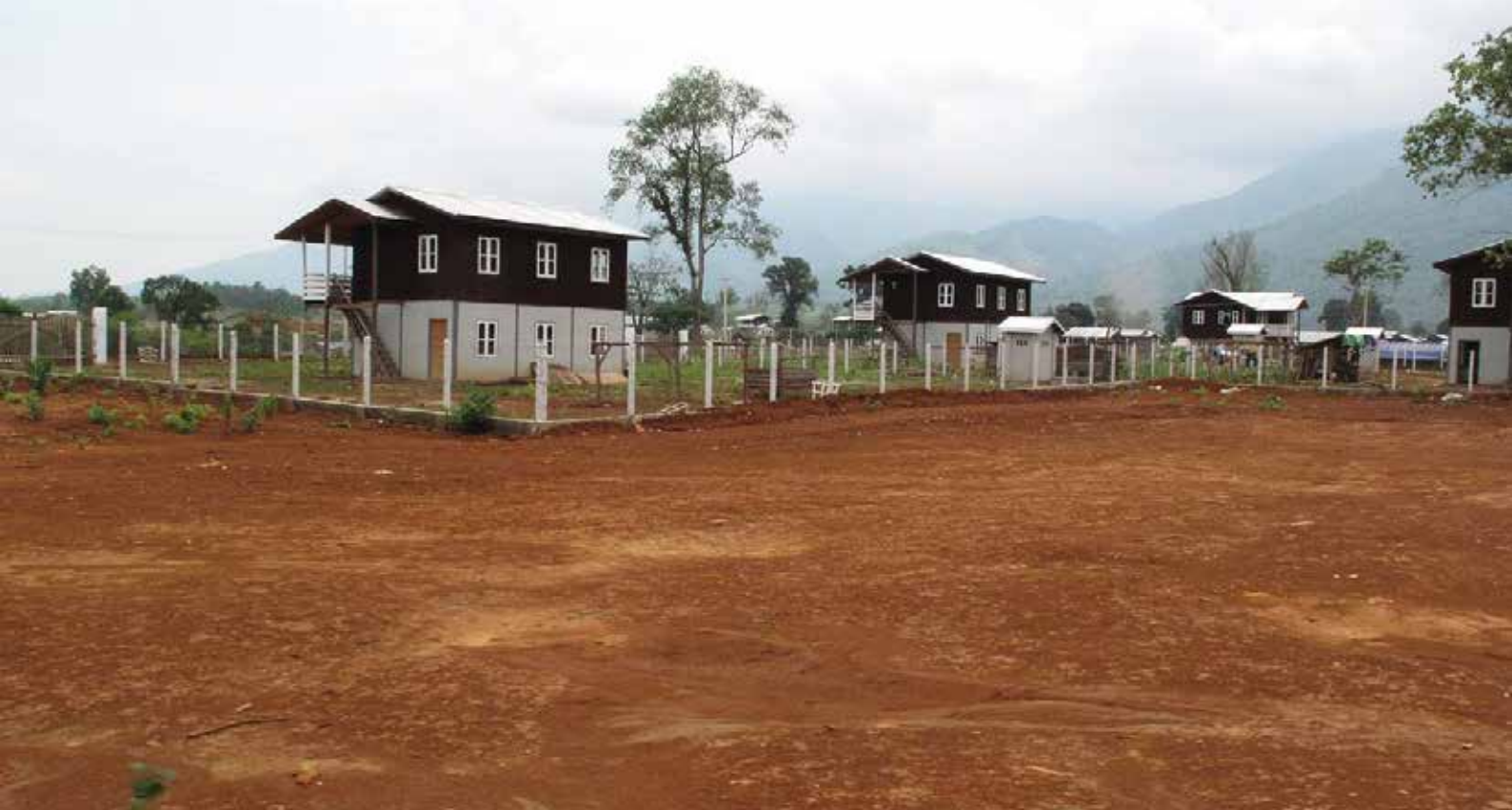
The village of Tang Hpre village relocated for the Myitsone Dam in Myanmar. Protests by the Kachin people forced the Myanmar government to suspend the project.

the construction of the Chinese-funded Myitsone Dam in 2012. Indeed, when Yangon opened up to the world in 2011, Beijing acknowledged that it lost much of the economic influence it had built up during Myanmar's period of isolation, but there was never any consideration on its part to restore its preeminent position by force or intimidation. 117 Nor was the deployment of force entertained when two nearby countries, Pakistan and Nepal, cancelled multibillion dam projects that these two governments had entered into with Chinese state enterprises, in the first case, because of objectionable conditions, and in the second because of the lack of competitive bidding. 118