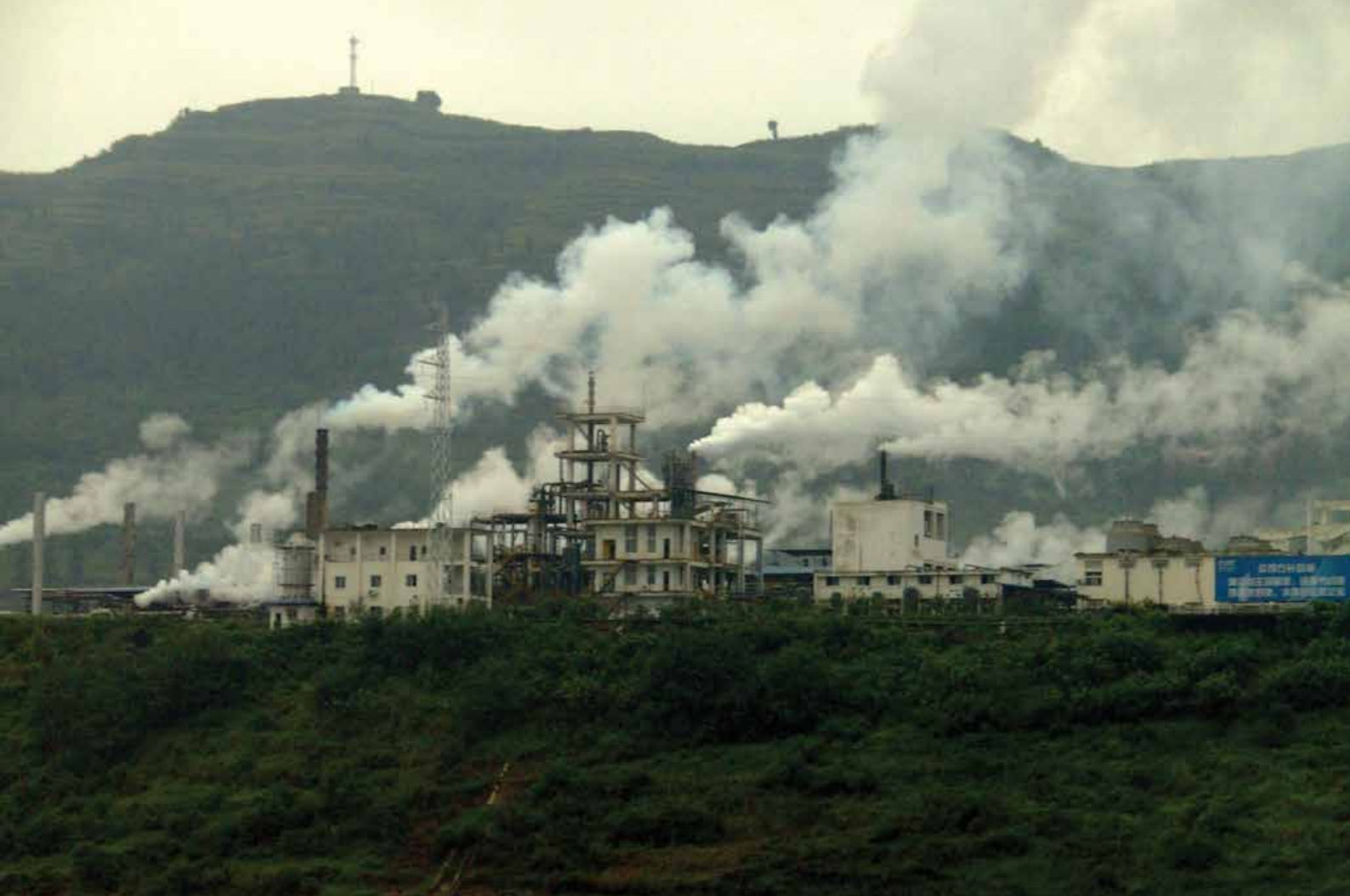
A factory along the Yangtze River belches smoke. Severe air pollution now plagues urban areas all over China.