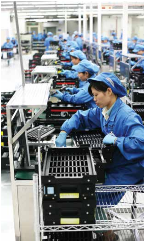
Women hard at work in a Seagate factory in Wuxi.

Gender is now one of the most important factors determining income inequality in China, perhaps more so than even the longstanding divide between the cities and the countryside. 63 Over the past decade,