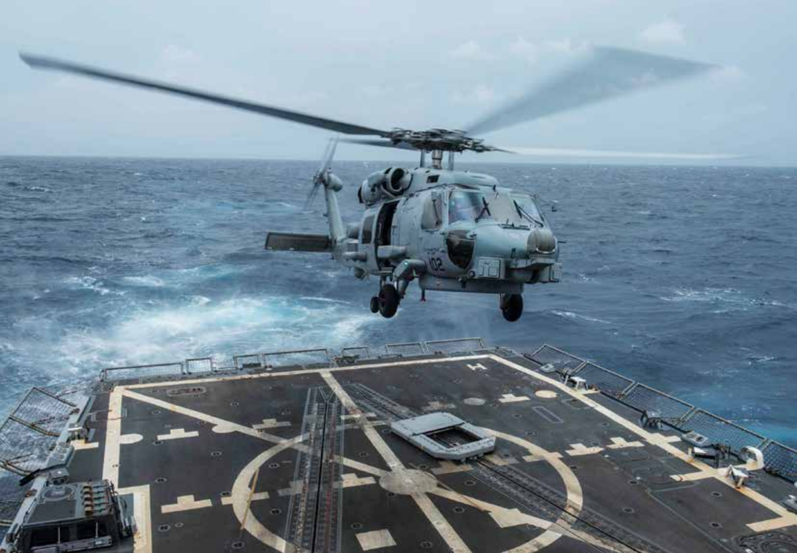
MH-60R helicopter launches from the flight deck aboard the guided-missile destroyer USS Spruance, which is part of the US 3rd Fleet.

The strategy guiding the formation of this cordon sanitaire is apparently that of “‘forward edge defense’ that would move potential conflicts far from China’s territory.” 195 This may have some success since, as Tata claims, “China’s advantage is that it does not have, nor does it seek, the responsibility for controlling the global maritime commons, and, therefore, Beijing can concentrate substantially its entire naval fleet on ensuring that it controls what it considers to be territorial waters within the Middle Kingdom’s maritime Great Wall.” 196