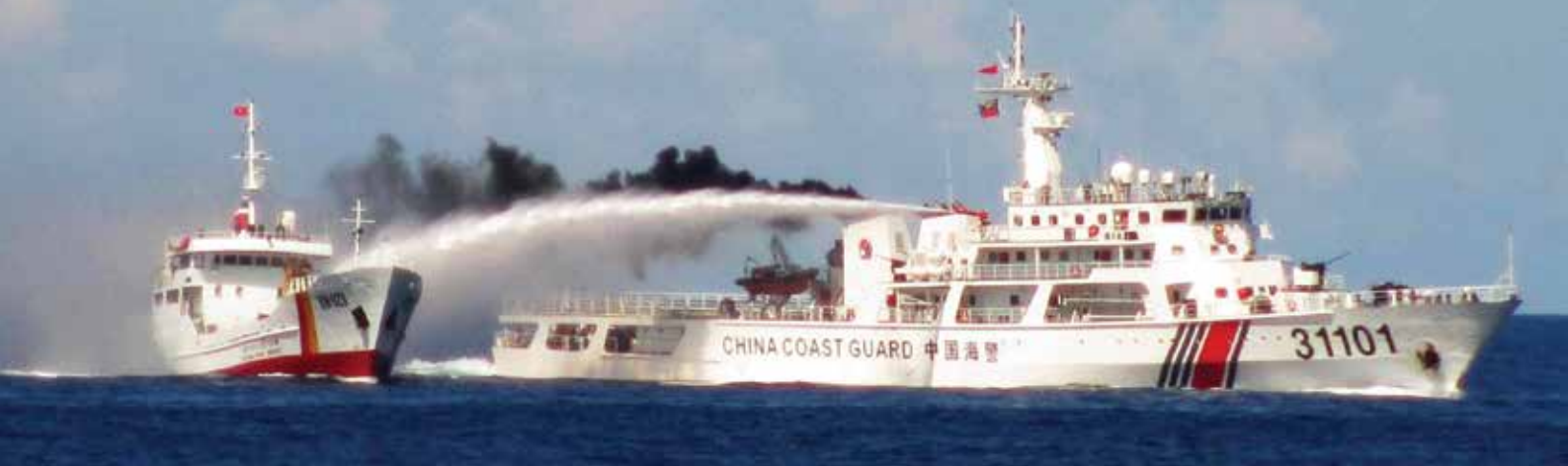
Chinese and Vietnamese government vessels face off at sea in a dispute over oil exploration rights in May 2014.

adjacent waters, and enjoys sovereign rights and jurisdiction over the relevant waters as well as the seabed and subsoil thereof." 198 The Chinese claim was rightly interpreted by China's neighbors as disregarding their rights to 200-mile Exclusive Economic Zones (EEZs) under the United Nations Convention on the Law of the Sea that was signed and ratified by Beijing. This was confirmed by a number of Chinese incursions into the zones of neighboring countries to engage in oil and resource exploration and drilling and harassment of their efforts to do so in their own EEZs. Chinese fishing boats, many actually government vessels, were also said to be entering their zones in large numbers, even as their own fishermen were harassed by Chinese maritime patrol ships.