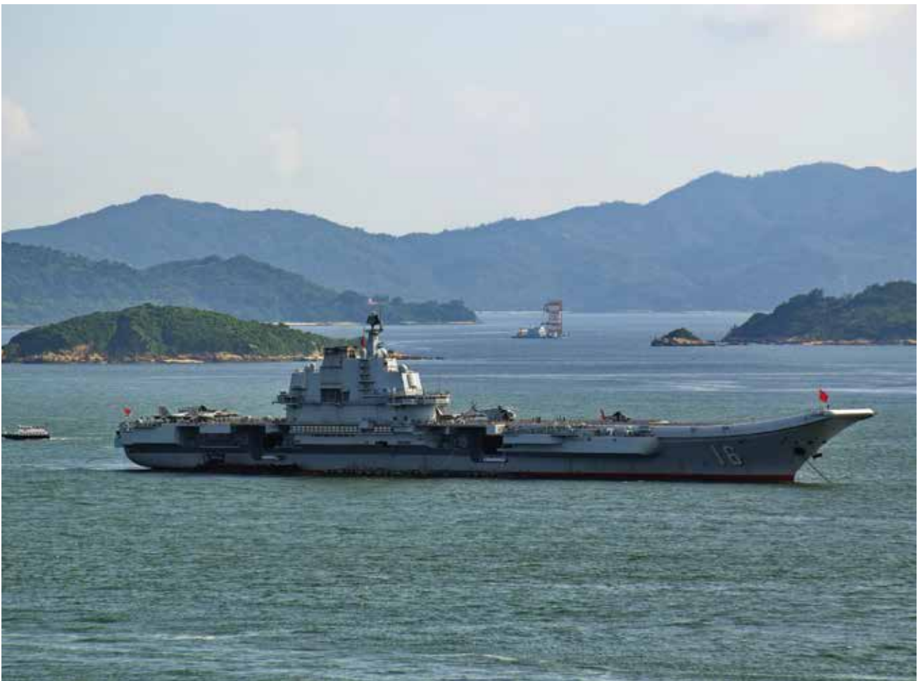
China's Liaoning aircraft carrier. China has only two aircraft carriers, one of which is still undergoing trials.

This perspective is what has guided the consistent US strategy of "forward defense,"