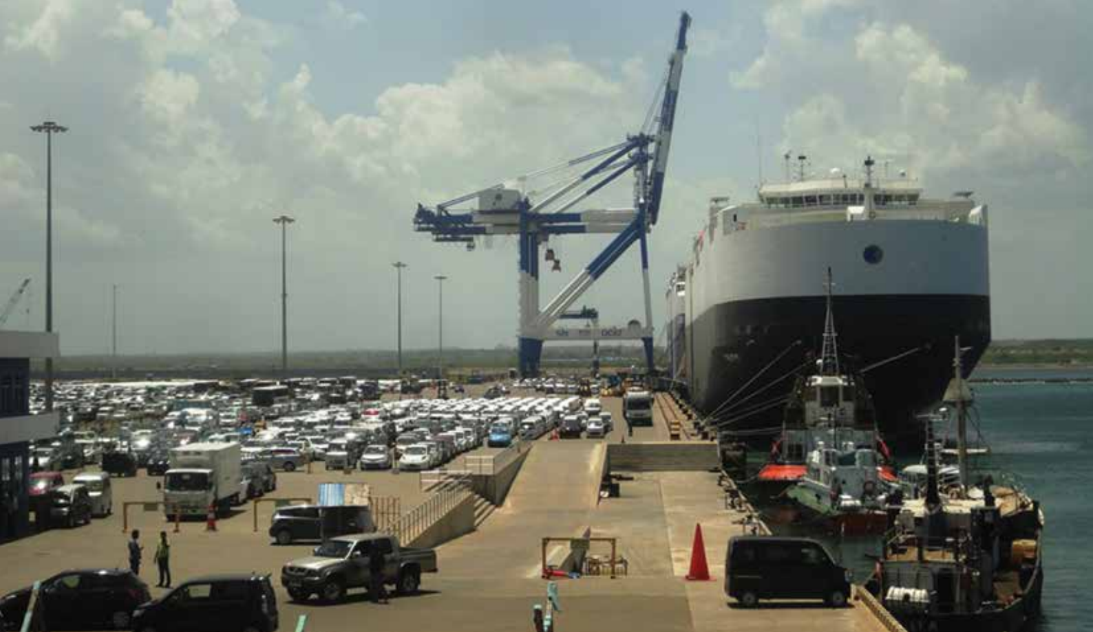
The money-losing Hambantota Port in Sri Lanka that was leased to China in exchange for a grant to cover the Sri Lankan government's debt to Beijing. Who got the better deal—Sri Lanka or China?—is still the subject of scholarly dispute.