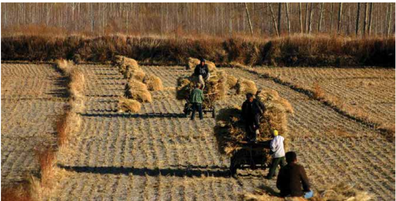
Harvest time in rural China. Chinese farmers were the main beneficiaries of the first stage of economic reform in the late seventies and eighties, but urban dwellers were prioritized in the next phase of export-led industrialization.

Being one of the victims—though not the most hapless—of Europe's primitive accumulation, modern China's emergence as a full-fledged industrial capitalist economy was delayed and only came about with the country's scrapping of its socialist experiment during the Mao period and its economic opening to the West in the late 1970's to the 1990's under the leadership of Deng Xiaoping. State capacity that had been built up under Mao was hitched to the project of rapid capitalist industrialization under Deng.