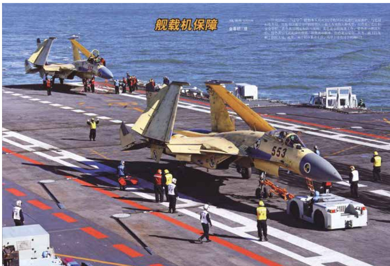
Shenyang J-15 jet fighter aircraft on deck of Chinese aircraft carrier Liaoning, one of only two People's Liberation Army Navy (PLAN) carriers (one of which is still undergoing trials.) The US has 11 carrier task force groups centered around mainly Nimitz-class supercarriers.

firm that became infamous for its actions in Iraq. In 2014, Prince was recruited to head Frontier Services Group (FSG), a new Hong Kong-based logistic and risk management firm with close ties to CITIC, China's biggest state-owned conglomerate. 186 Its main business, according to Hung, "is to provide security services to Chinese companies in Africa through a network of subcontractors on the ground. In late 2016, the company announced that it was to adjust its corporate strategy to "better capitalize on the opportunities available from China's One Belt, One Road (OBOR) development initiative." It seems that instead of building up the power projection capabilities of its security agencies, China, at least in the short to medium term, is taking the route of having mercenaries take over a significant part of that role.