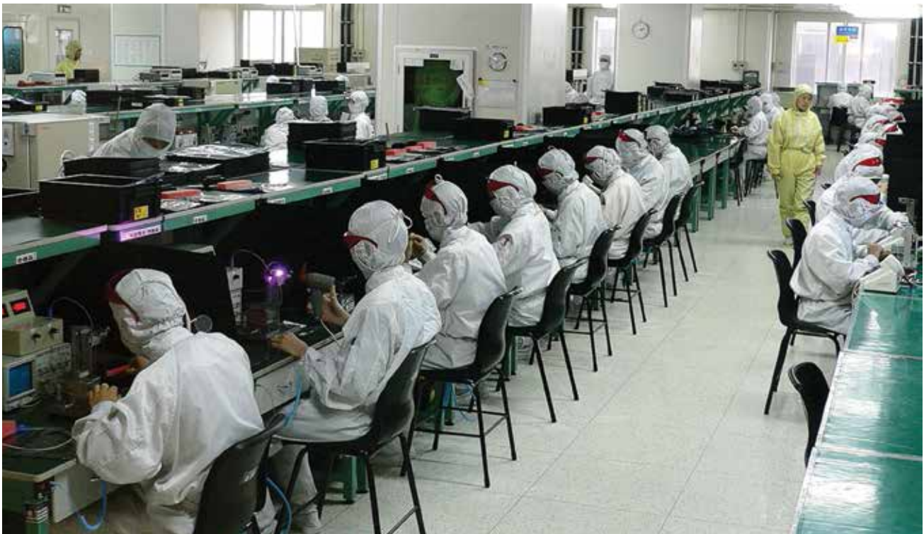
Workers and supervisor at an electronics factory in Shenzhen. Labor-intensive assembly of components for electronic exports was the cutting edge of China's export success. With labor costs rising, electronics assembly and garments firms are moving to areas with cheaper labor, like Vietnam.

of these sometimes operate as virtual fiefdoms. But the key factor ensuring that the economy does not degenerate into anarchy is the nationwide structure of the Communist Party which parallels the state structure at all levels, cuts across regions, and exercises a discipline unmatched by state agencies. "Decentralized authoritarianism," is probably the most apt description of this system.