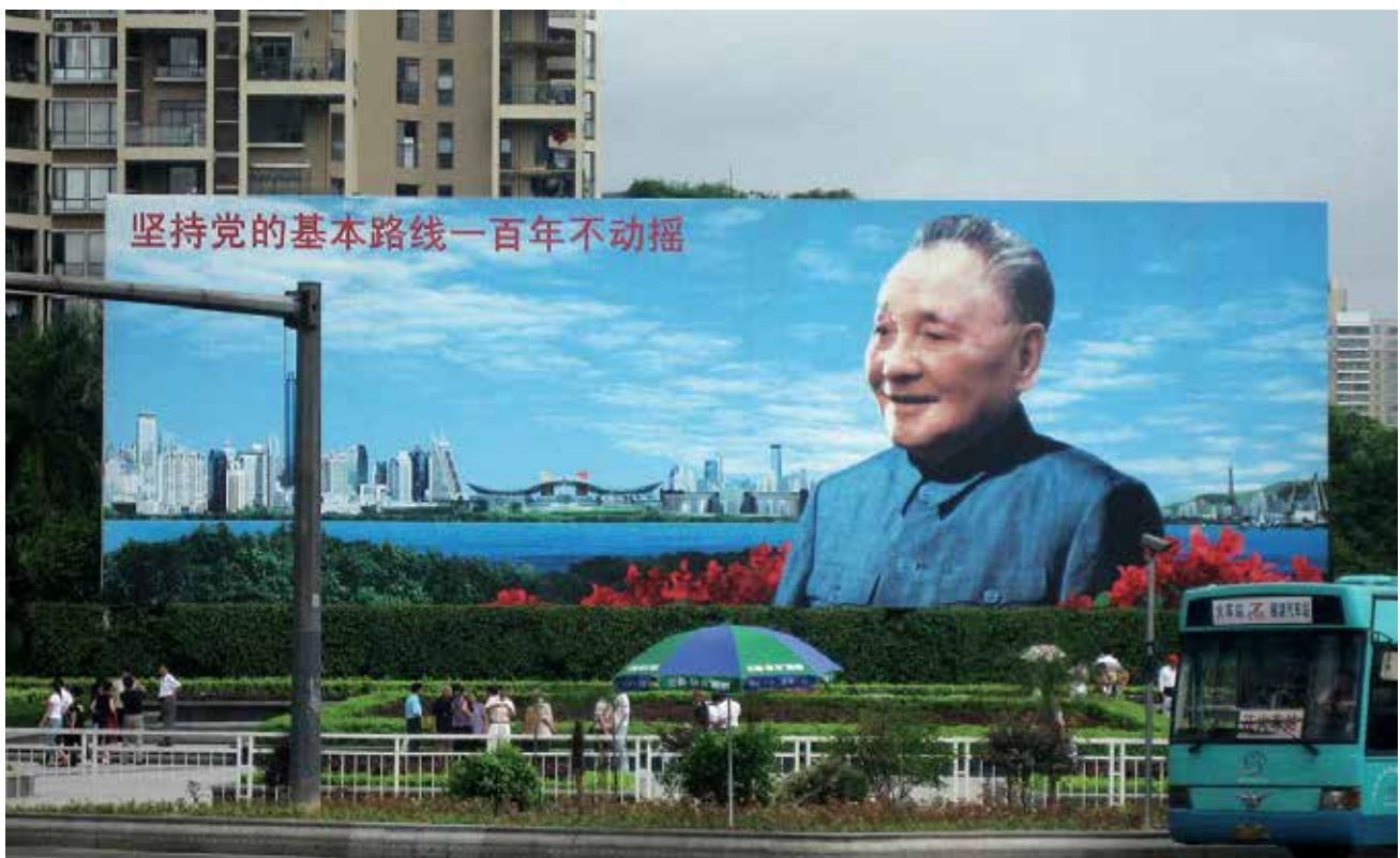
Roadside billboard honors Deng Xiaoping, father of China's economic liberalization, at the entrance of the Lychee Park in Shenzhen.

This does not mean that there was no state violence or direct coercion at all. While the absence of state violence was clear when it came to China's global trade and investment push beginning in the 1990's, this was not the case domestically. There was the relocation of thousands of peasant families to clear the way for the Three Gorges Dam in the Yangtze River 10 as well as legally sanctioned takeovers of peasant properties by revenue-short local authorities for urban development. 11 Still, the overall approach in the first decade of the reform was to encourage peasant prosperity as the engine of growth, 12 while today the rural areas benefit from reforms such as free compulsory education for the first nine