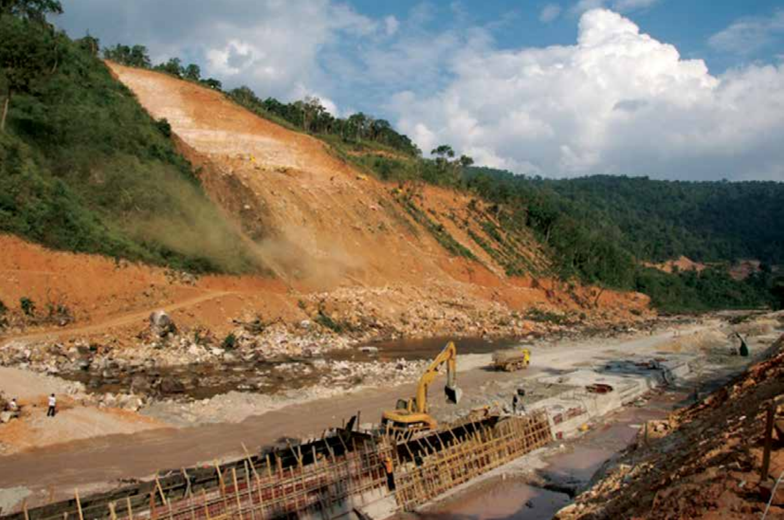
Activists and analysts allege that controversial Kamchay Hydroelectric Dam in Cambodia benefits mainly local elites.

greater inequality, and greater poverty in large swathes of Latin America and Africa in the 1980's and 1990's. 106