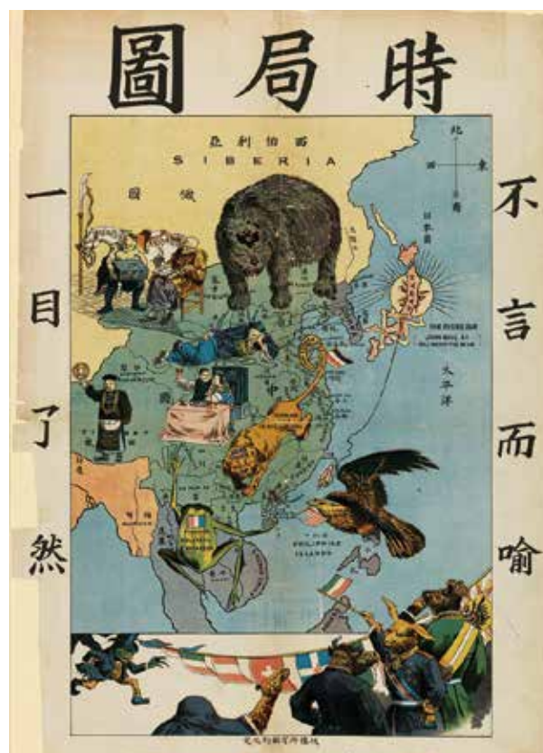
A cartoon (ca 1900) showing foreign powers conspiring to dismember China.

The military revolution...created war states, elevating and sustaining more