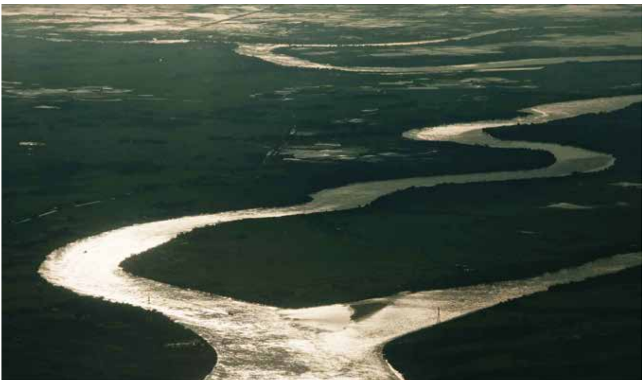
The Myitsone Hydroelectric Project is located at the confluence of the Mali and N'Mai rivers and is the largest of seven dams (total capacity 13,360 MW) planned along the Irrawaddy, Mali Hka, and N'Mai Hka rivers in Myanmar. Scheduled for completion in 2019, Myitsone was slated to become the 15th largest hydropower station in the world, with installed capacity at 6,000 MW, when construction was suspended by the Myanmar government owing to protests from the Kachin people.

The question is, however, posed: might not be the question of whether or not China is reproducing the ways of the West, while very important, be rather limited in helping us to fully comprehend its impact in the global South?