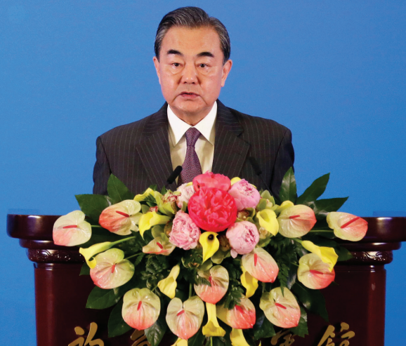
China's Foreign Minister Wang Yi delivers a speech at an international forum on the Belt and Road Initiative in Beijing, on July 2, 2018.