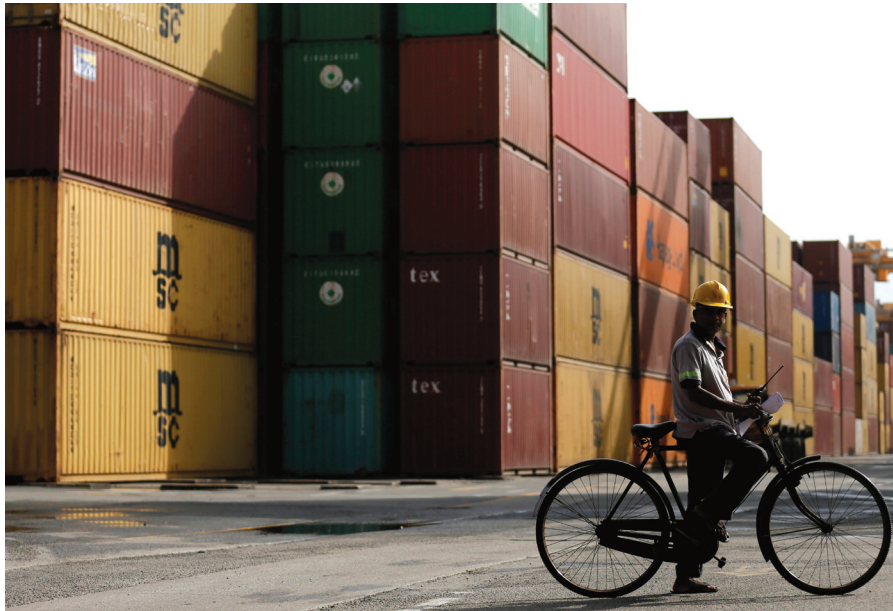
An operator works as shipping containers are seen in the background at the main port in Colombo, Sri Lanka.