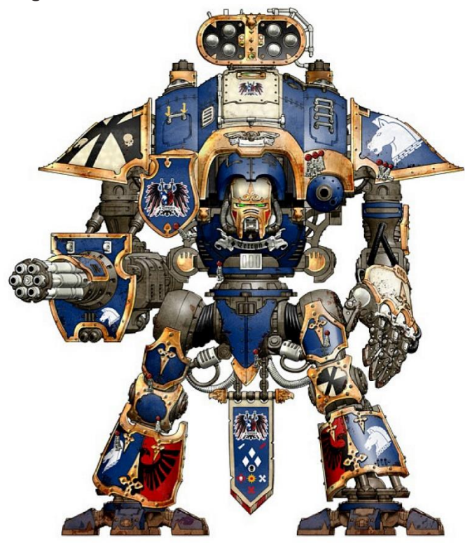
May mount Carapace weapons.