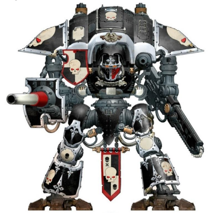
Torso mounted Heavy Stubber or Meltagun Reaper Chainsword or Thunderstrike Gauntlet May mount Carapace weapons.

For long-ranged devastation, there are few weapons that can match or best the Knight Paladin's rapid-fire battle cannon. This massive barrelled weapon is equally adept at blasting apart massed hordes of enemy infantry, gunning down entire squadrons of light vehicles, or duelling a foe's artillery at long range. Incoming firepower is blunted as the pilot shifts the directional ion shield towards the approaching shots. With its long strides, the Knight Paladin can reposition quickly, firing as it manoeuvres to give maximum fire support. Should enemies approach too closely, a pair of heavy stubbers can mow them down. In close combat, the reaper chainsword or thunderstrike gauntlet the Knight Paladin carries makes it virtually unstoppable, able to disregard any enemy armour with impunity.