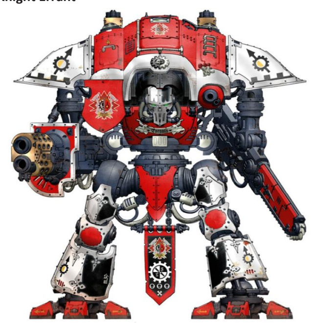
Thermal Cannon Torso mounted Heavy Stubber or Meltagun Reaper Chainsword or Thunderstrike Gauntlet May mount Carapace weapons.

The Errant class Knight can charge and destroy a tank battalion, for it is a colossal ion-shield-protected war machine capable of immense close-ranged destruction. The main armament of the Knight Errant is the thermal cannon, a weapon whose blasts can immolate plasteel bunkers or turn a battle tank into molten slag. The Knight Errant's close combat weapon – either a reaper chainsword or thunderstrike gauntlet – is perhaps more deadly still. When powered by the Knight's mighty servo-engines, either of these weapons can topple even the most monstrous xenos creature with a single strike. Fitted into the Knight Errant's armoured carapace is a heavy stubber to scythe down enemy infantry, and its armourplated feet are more than capable of crushing units beneath its awesome weight. Weapons: