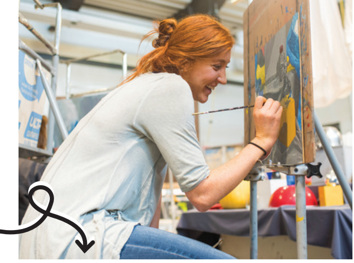
IN CONJUNCTION WITH A CAREER COACH AT MESSIAH, UTILIZE THE FOCUS SYSTEM THROUGH THE CAREER AND PROFESSIONAL DEVELOPMENT CENTER TO GO A BIT MORE IN DEPTH WITH THIS EXERCISE.

The most foundational step in choosing a major is a thorough assessment of your strengths, interests, abilities and values. Try making a list after considering what you have enjoyed from past experiences – school subjects, hobbies, activities and so on. Then, go one step further and ask yourself what it was about those activities that was energizing for you? Try and get as specific as you can. Did they allow you to interact with people? Use your creativity or work with your hands? Often, this is a more difficult task than anticipated!