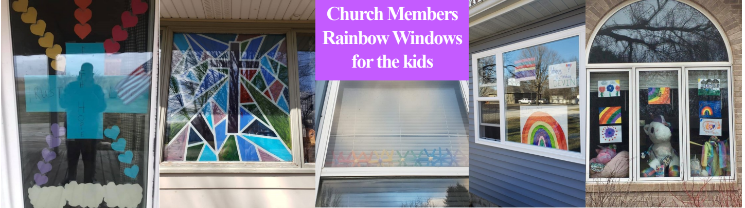
Church Members Rainbow Windows for the kids

Non-Profit Organization U.S. Postage PAID Permit No. 153 Emmetsburg, Iowa