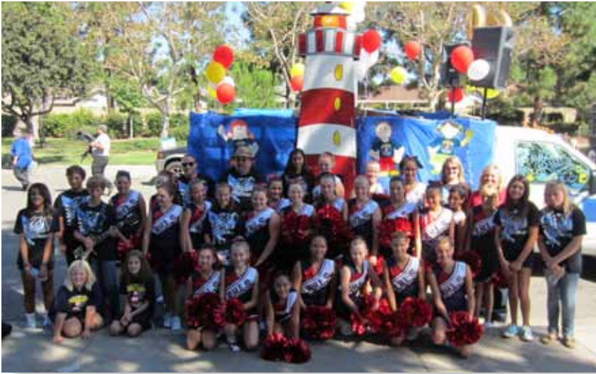
RHLS Staff and students at the Tiller Days Parade!