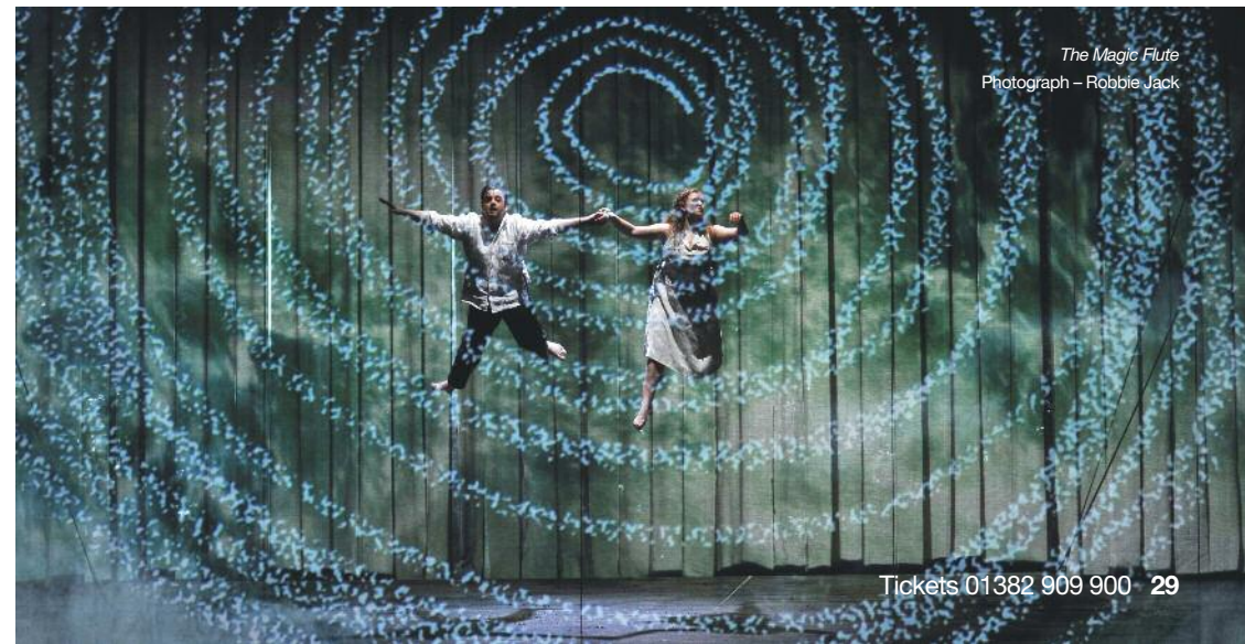
The Magic Flute