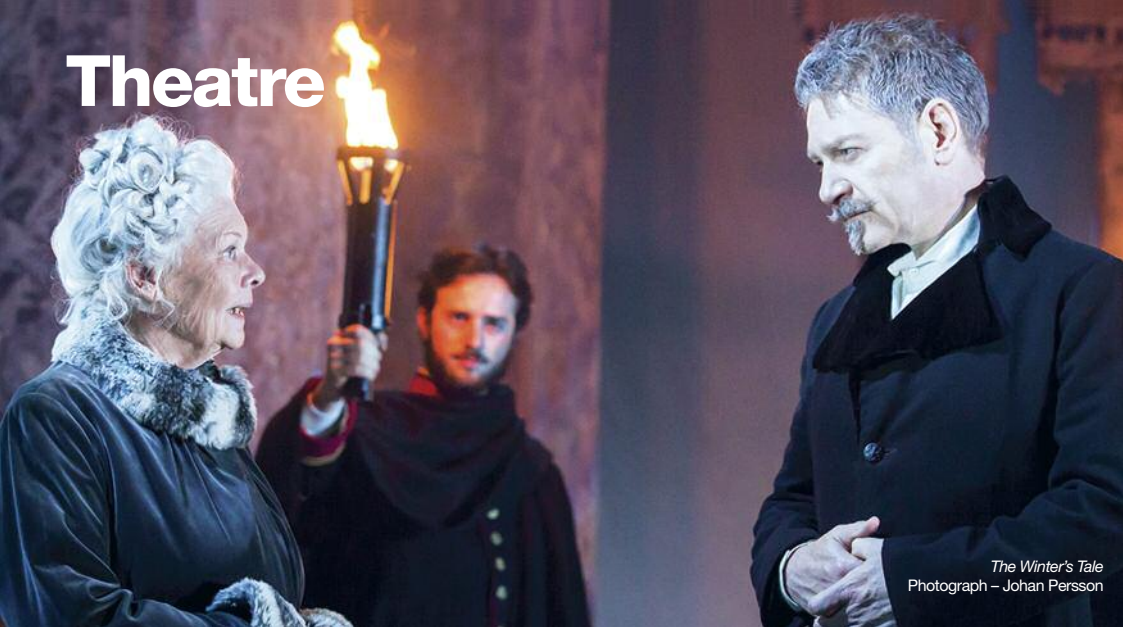
The Winter's Tale