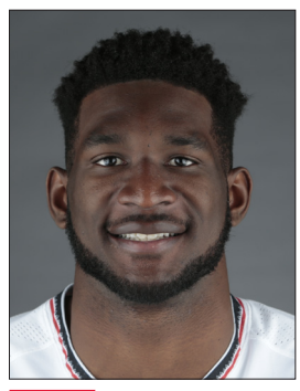
F/C • 6-9 • 220 • FR-HS KINSASHA, CONGO