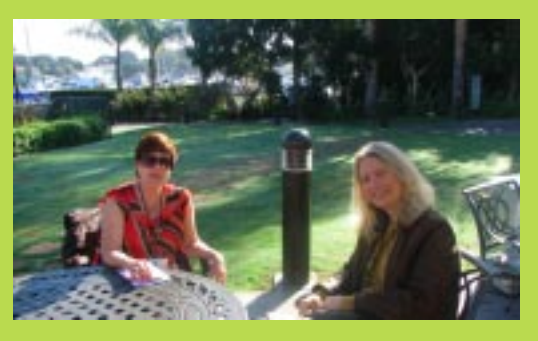
San Francisco-East Bay