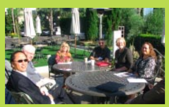
Far North and North Central