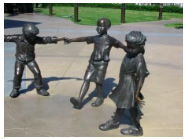
In spite of pirates and recession, and other headaches, CIOs manage to have fun

CIOs attending the fall conference managed to seize three beautiful October days in San Diego as they debated strategies to survive disastrous budgets, negative accreditation reports, and ever growing demands for data. They were also given advice: stick to your mission, stay serene under fire, and act like a pirate.