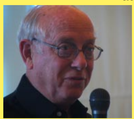
CIOs join the dialog on crises