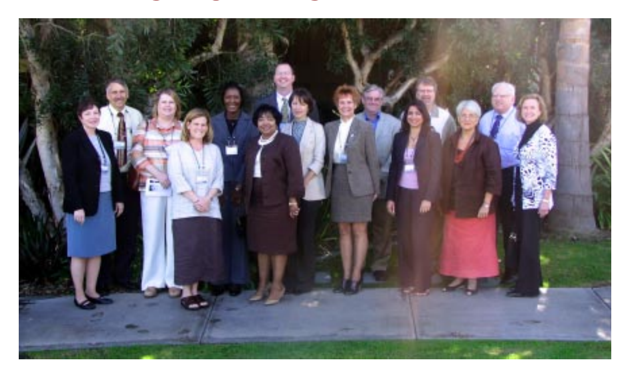
Proud 411 CIO Academy Members