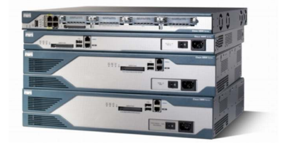
Figure 1. Cisco 2800 Series

Cisco Systems<sup>®</sup>, Inc. is redefining best-in-class enterprise and small- to- midsize business routing with a new line of integrated services routers that are optimized for the secure, wire-speed delivery of concurrent data, voice, video, and wireless services. Founded on 20 years of leadership and innovation, the Cisco<sup>®</sup> 2800 Series of integrated services routers (refer to Figure 1) intelligently embed data, security, voice, and wireless services into a single, resilient system for fast, scalable delivery of mission-critical business applications. The unique integrated systems architecture of the Cisco 2800 Series delivers maximum business agility and investment protection.