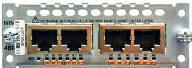
Figure 2. 4-port NIM (front)