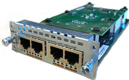
Figure 1. Cisco 4-Port ISDN BRI S/T NIM

The Cisco® 4000 Series Integrated Services Routers (ISRs) offer a wide variety of WAN connectivity modules to accommodate the range of application needs in customer networks. The Cisco 2- and 4-Port ISDN BRI S/T Network Interface Modules (NIMs) offer investment protection by providing data connectivity to legacy ISDN networks for the 4000 Series ISRs (Figure 1).