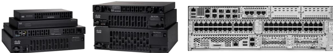
Figure 1. Cisco 4000 Series Integrated Services Routers

The ISR 4000 Series contains the following platforms: the 4461, 4451, 4431, 4351, 4331, 4321, and 4221 ISRs.