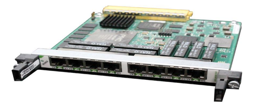
Figure 1. Cisco 8-Port Channelized T1/E1 Shared Port Adapter Version 2

The Cisco® 8-Port Channelized T1/E1 Shared Port Adapter (SPA) Version 2 takes advantage of the Cisco I-Flex approach, which combines shared port adapters and SPA interface processors (SIPs). This extensible design helps prioritize data, voice, and video services. Enterprise and service provider customers can take advantage of improved slot economies, which result from modular port adapters that are interchangeable across Cisco routing platforms. The I-Flex design increases connectivity options and offers superior service intelligence through programmable interface processors that can deliver line-rate performance. I-Flex enhances speed-to-service revenue and provides a rich set of quality of service (QoS) features for premium service delivery, while effectively reducing the overall cost of ownership.