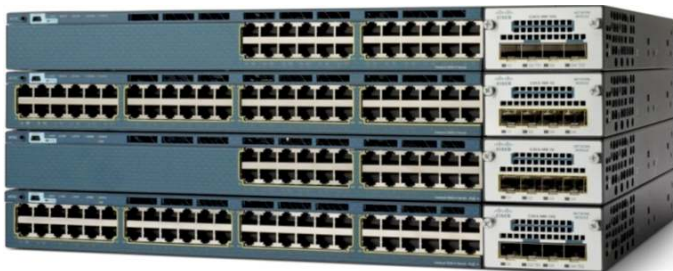
Figure 2. Cisco Catalyst 3560-X Series Switches

Figure 2 shows Cisco Catalyst 3560-X Series Switches.