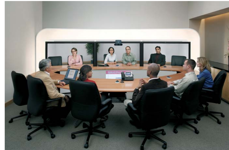
Unauthorized use not permitted.