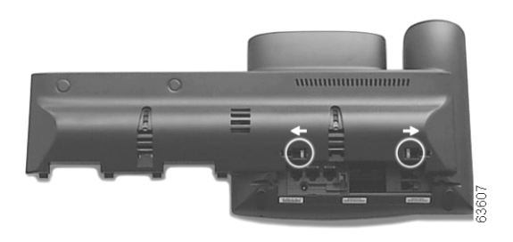
Figure 3 Connecting the Support Bar

Refer to Figure 3 and the steps that follow.