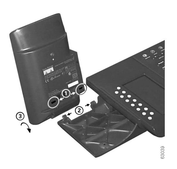
Figure 4 Connecting the Expansion Module