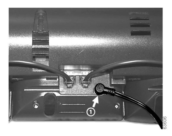
Figure 6 Connecting the Power Supply

Power supply connector on the back of the Expansion Module