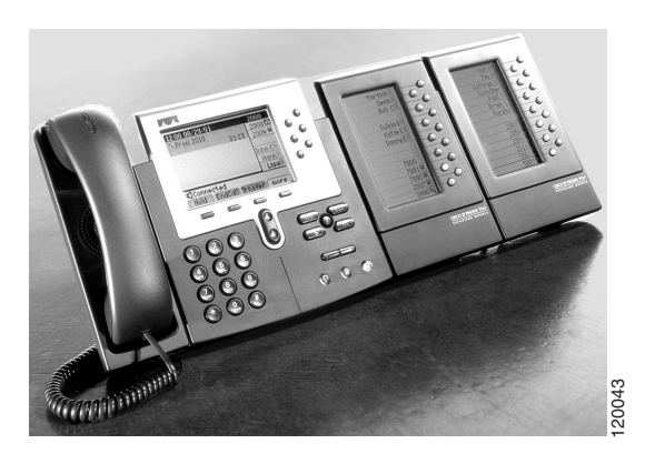
Figure 1 Cisco IP Phone 7960G with 2 Expansion Modules

The Cisco IP Phone 7914 Expansion Module attaches to your Cisco IP Phone 7960G, adding 14 extra line appearances or programmable buttons to your phone. The programmable buttons can be configured for speed dial numbers or to access phone services. You can attach one or two Expansion Modules to your Cisco IP Phone 7960G.