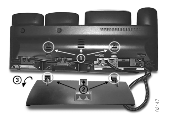
Connecting the Footstand Figure 7

Refer to Figure 7 and the steps that follow.