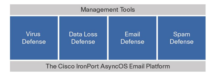
Figure 3. Power at the Perimeter: The Cisco IronPort C370 Provides Multilayered Security on a Single Appliance by Combining Revolutionary Cisco IronPort Technology with Additional Market-Leading Solutions

Today's email-borne threats consist of virus attacks, spam, false positives, DDoS attacks, directory harvest attacks, phishing (fraud), data loss, and more. The Cisco IronPort C370 addresses the issues faced by medium-sized enterprises and satellite offices by uniquely combining powerful performance with preventive and reactive security measures that are easy to deploy and manage.