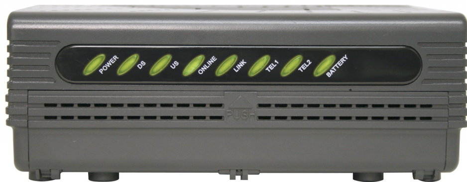
Figure 1. DPC2203 Cable Modem with Embedded MTA (image may vary from actual product and specification)

The DPC2203 fully supports the CODECs specified in PacketCable 1.5. Additional CODECs are available through a software upgrade that includes a high fidelity CODEC option for toll-quality plus service. Standard VoIP call signaling is compliant with PacketCable's (MGCP/NCS) specifications. Software upgrades are available to support Session Initiation Protocol (SIP) call signaling.