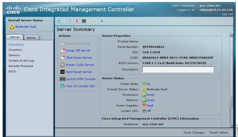
Figure 2-1 CIMC Window with Product ID (PID)

Module type is : Nexus 1010 (Virtual Services Appliance) 0 submodules are present Model number is Nexus 1010 H/W version is A UUID is 03BB2905-E130-DF11-68A1-68EFBDF61D42 Manufacture date is 03/29/2010 Serial number is QCI1410A4WG Module2 ok Module type is : Nexus 1010 (Virtual Services Appliance) 0 submodules are present Model number is Nexus 1010 H/W version is A UUID is 62ED8405-7031-DF11-4DA5-68EFBDF62300 Manufacture date is 03/29/2010 Serial number is QCI1410A4LP