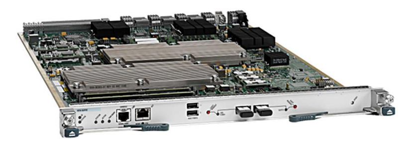
Figure 2. Cisco Nexus 7000 Series Supervisor2 Enhanced Module

The Cisco Nexus 7000 Series Sup2E Module (Figure 2) is based on a two-quad-core Intel Xeon processor with 32 GB of memory that scales the control plane by harnessing the flexibility and power of the two quad cores. With four times the CPU and memory power of the first-generation Cisco Nexus 7000 Series Supervisor1 (Sup1) Module, the Sup2E module offers the highest control-plane performance and scalability of the modules: for example, supporting more VDCs<sup>1</sup> and fabric extenders.