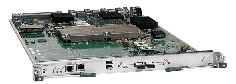
Figure 3. Cisco Nexus 7000 Series Supervisor2 Module

The Cisco Nexus 7000 Series Supervisor2 (Sup2) Module (Figure 3) is based on a quad-core Intel Xeon processor with 12 GB of memory and scales the control plane by harnessing the flexibility and power of the quad cores. A faster CPU and expanded memory compared to the first-generation Sup1 module enable better control-plane performance and an enhanced user experience.