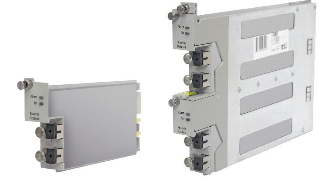
Figure 1. Cisco Prisma II High Density Dual Reverse Receiver (Left) and Populated Host Module (Right)

* The 56-connector version of the chassis is required to make use of all 4 receivers in one chassis slot.