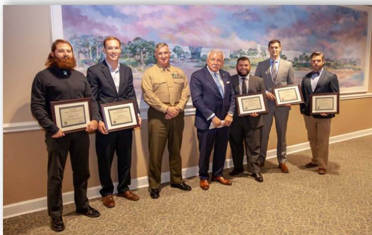
2019 Baker Fellows Recipients