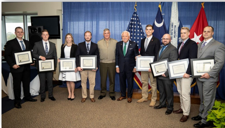
2020 Baker Fellows Recipients

For application requirements and deadline dates, please visit the website at https://www.citadel.edu/root/tommy-baker