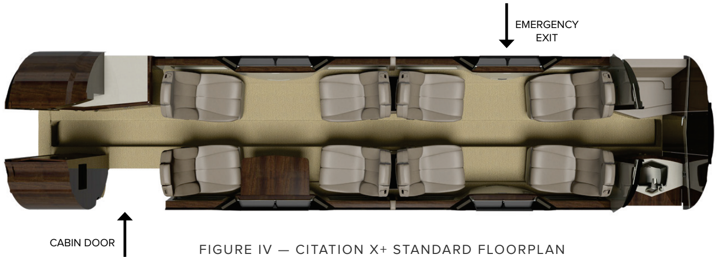
FIGURE IV — CITATION X+ STANDARD FLOORPLAN