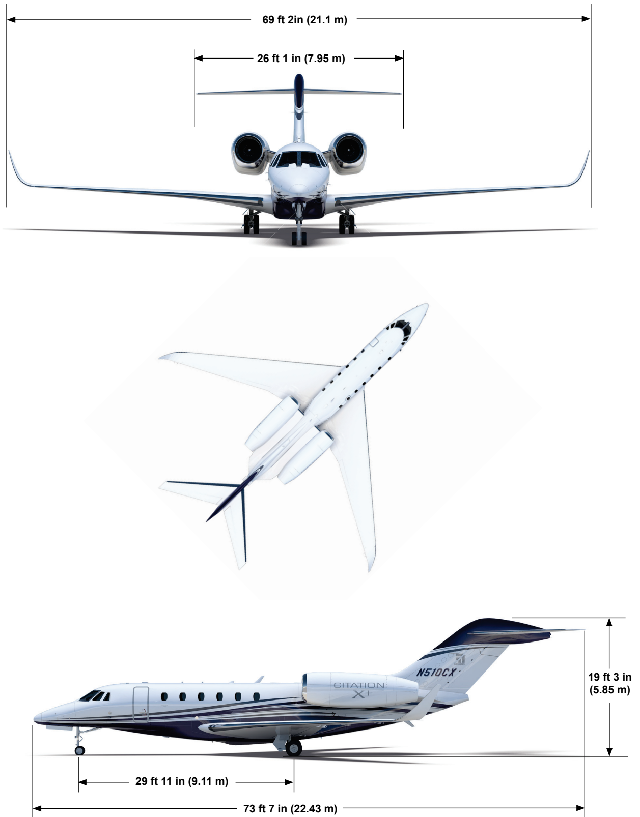
FIGURE I — CITATION X+ EXTERIOR DIMENSIONS