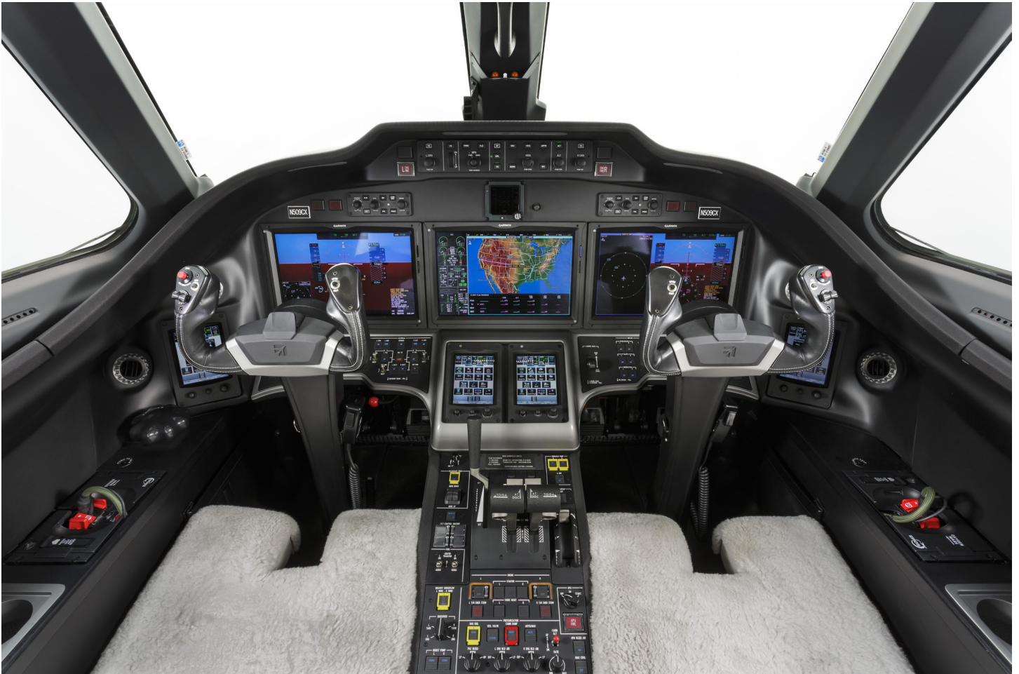
FIGURE III — CITATION X+ INSTRUMENT PANEL AND PEDESTAL LAYOUT