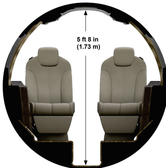
FIGURE II — CITATION X+ INTERIOR DIMENSIONS