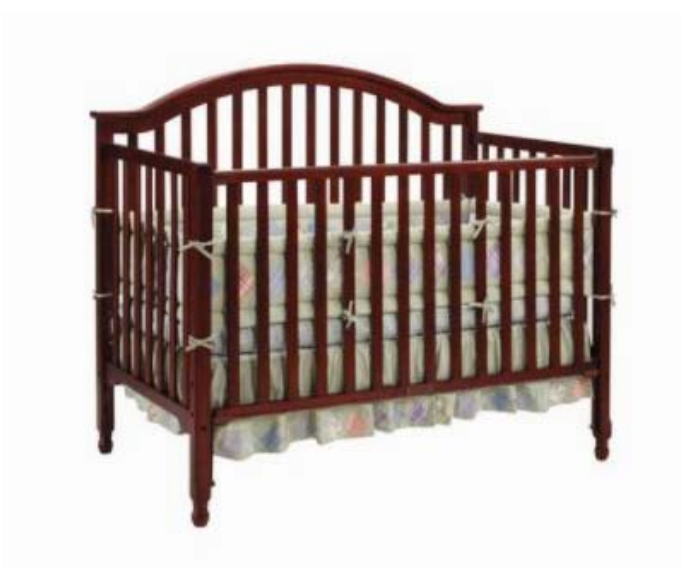
Dorel Asia's Lexington Collection 3-in-1 Convertible Crib

The Lexington Collection cribs have drop sides with plastic latches that allow the side of the crib to move up and down for easier access. The Biccums believe that these plastic latches are prone to breaking as occurred with their crib. When they break, they can cause detachment of the drop side and create a dangerous gap into which an infant can become entrapped.