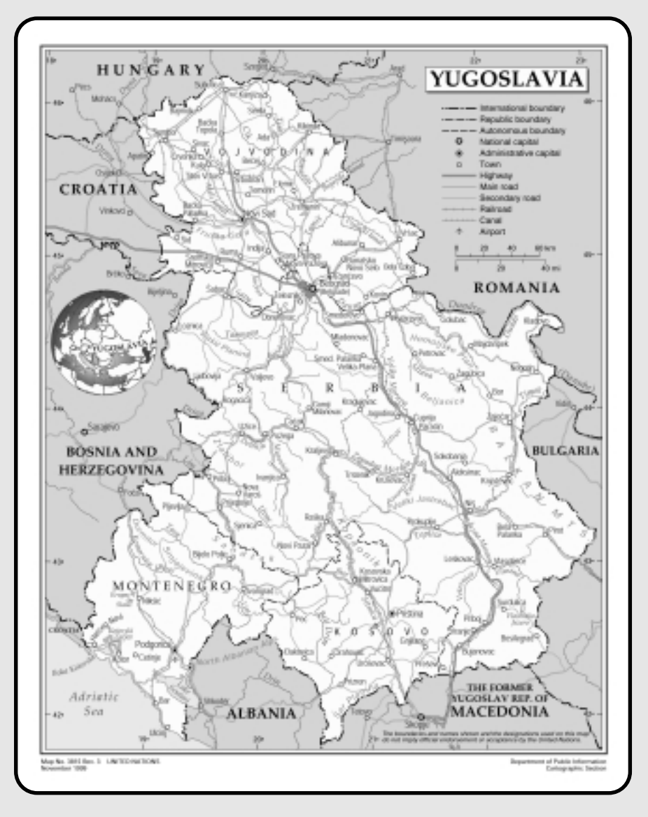
Figure 4.1: Map of Republic of Serbia showing three regions for sample stratification

The Republic of Serbia was divided into three strata (or research designated regions): Belgrade, Central Serbia and Vojvodina. This stratification is standard in social science research within the Republic of Serbia. The national sample of schools, cross-tabulated by region, is provided in Table 4.5.