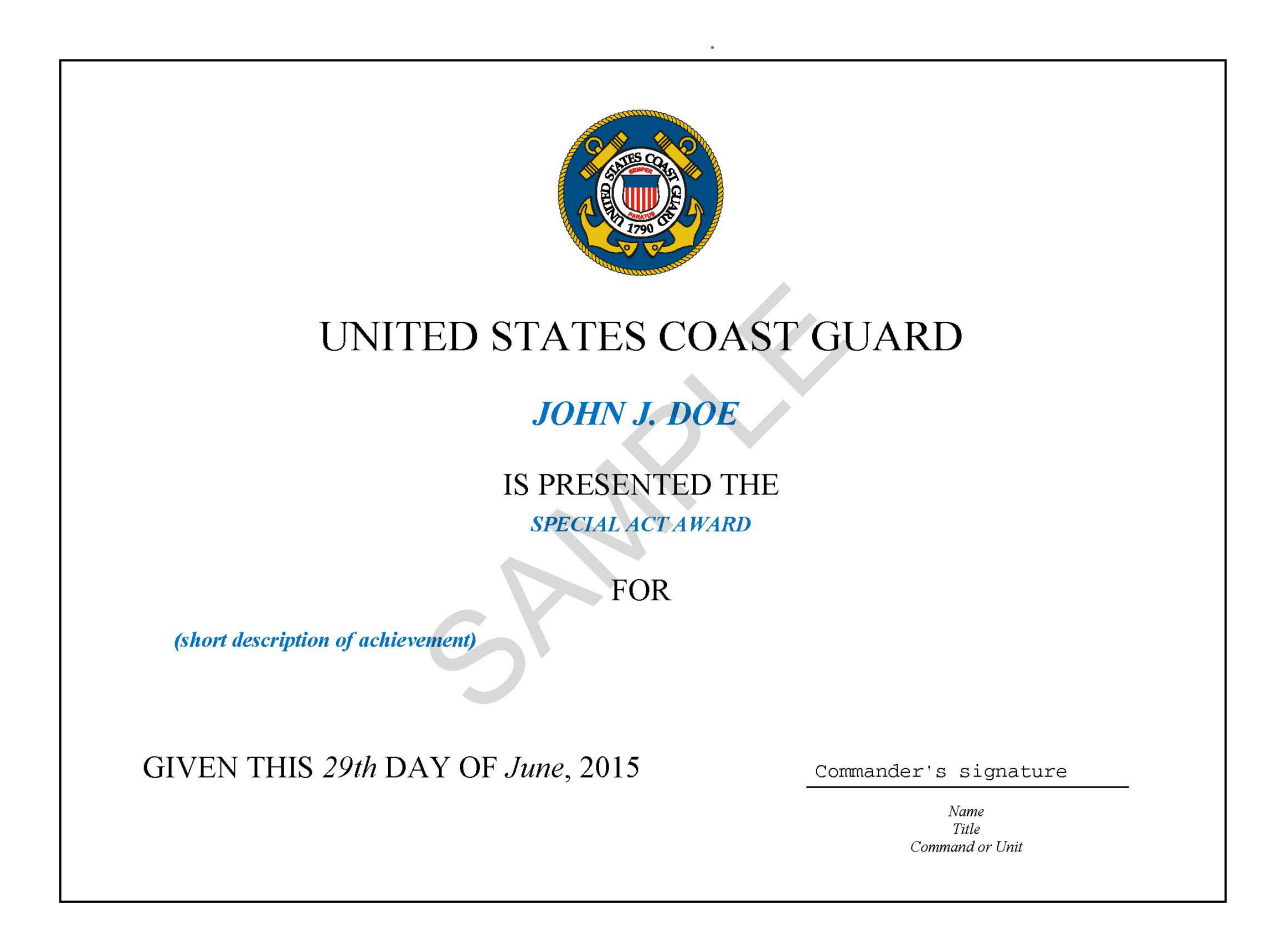
Figure 9-1 Sample of a Generic Award Certificate Special Act Award