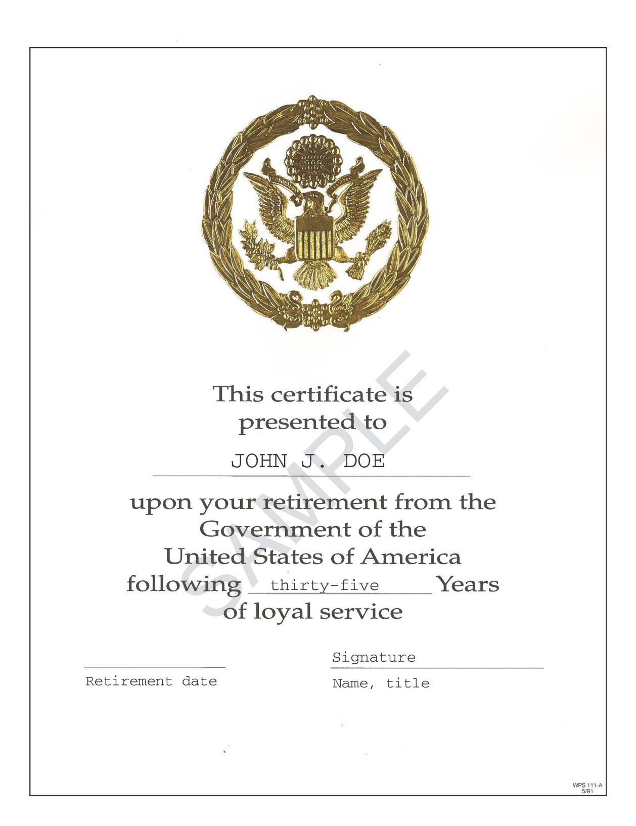
Figure 13-2 Sample of Form WPS 111-A Retirement Certificate