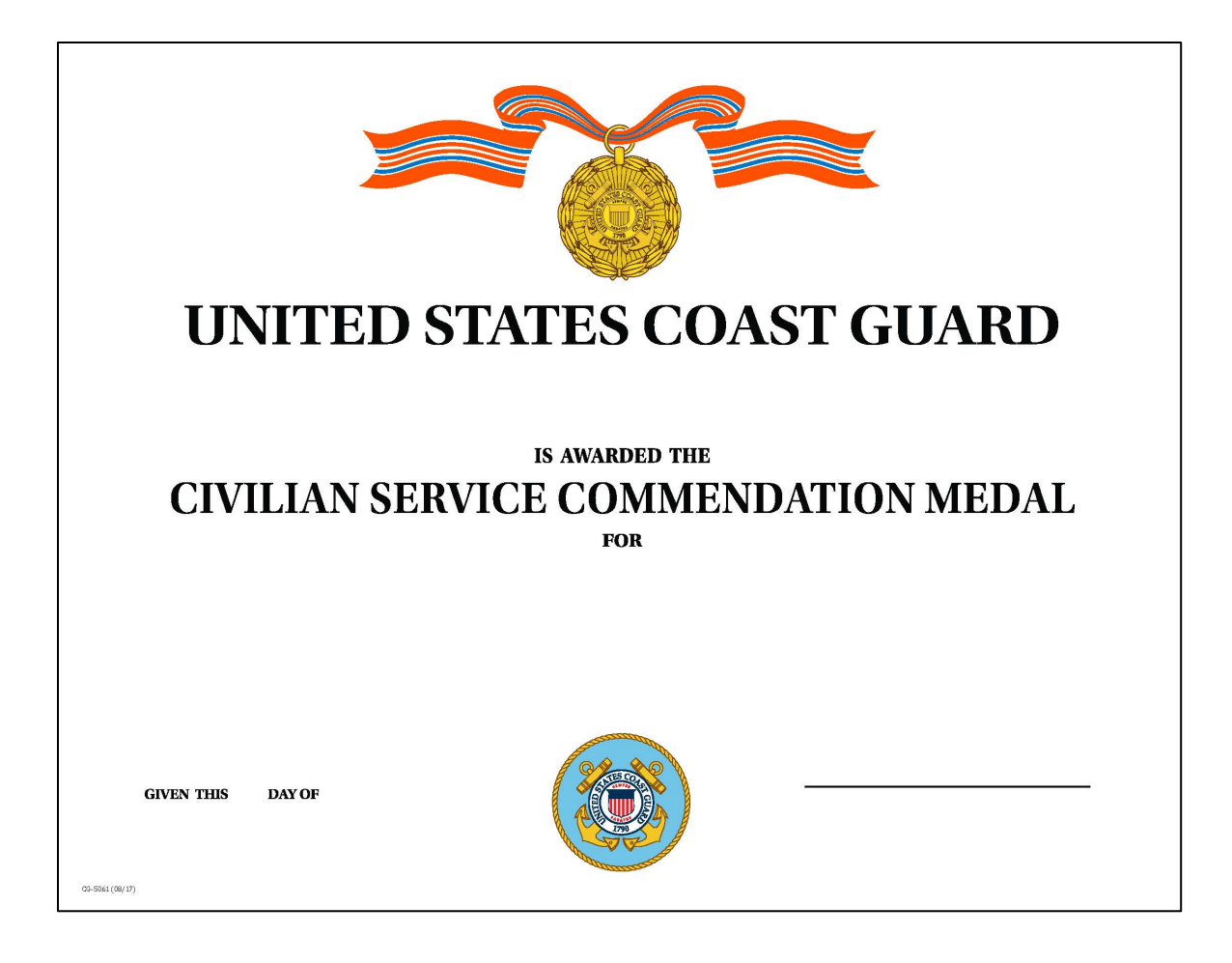
Figure 4-5 Sample of Form CG-5061 Civilian Service Commendation Medal Certificate