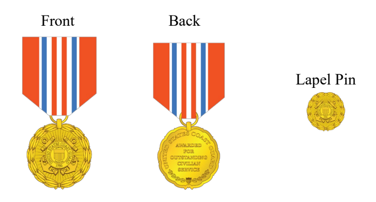
Figure 4-6 Civilian Service Commendation Medal