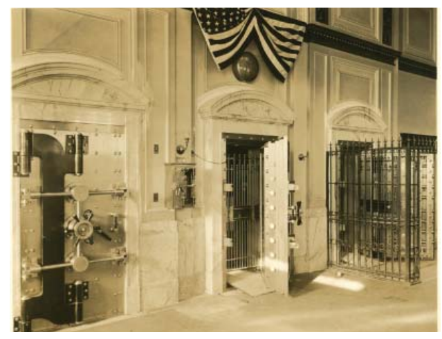
The vaults in the Bank of Eureka - today home to the museum office and library.