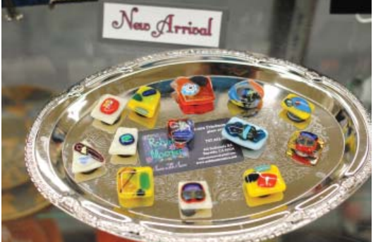
Robin's Mosaics magnets make the perfect stocking stuffer

When holiday shopping this season, stop by the Clarke Museum gift shop. Looking for some tasty treats