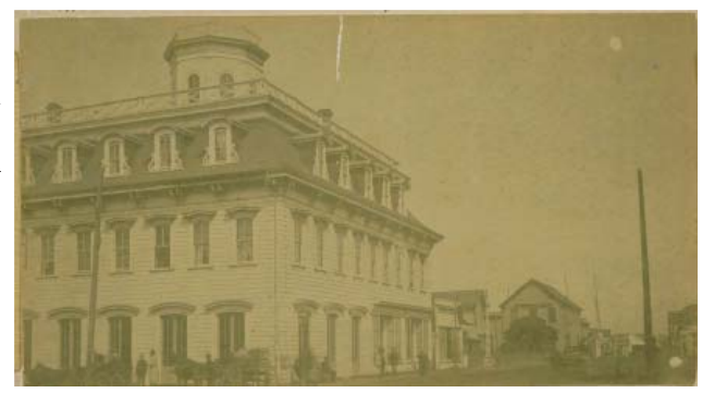
The Bay Hotel on the corner of Third and E Street. Hotel burned down on July, 5 1889.

This year is the 100th anniversary of the Bank of Eureka opening its newly constructed building, which today is home to the Clarke Historical Museum. The area in-