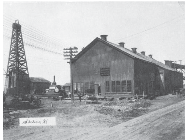
Constructed in 1910 by Western States Electric, Station B operated by primarily burning sawmill waste.

In particular, PG&E Humboldt Bay Power Plant was the first privately funded nuclear power plant built in the United States for the sole purpose of providing commercial electricity. The construction and op-