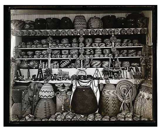
Brizard Basket Collection, c. 1900, Arcata Store

Showcasing the work of Native American basket makers from Northwest California, Made for the Trade is an exhibition featuring woven items expressly crafted for the curio trade which flourished between 1880 to 1929. Most of the items displayed are between 60 and 120 years old and represent an exqui-