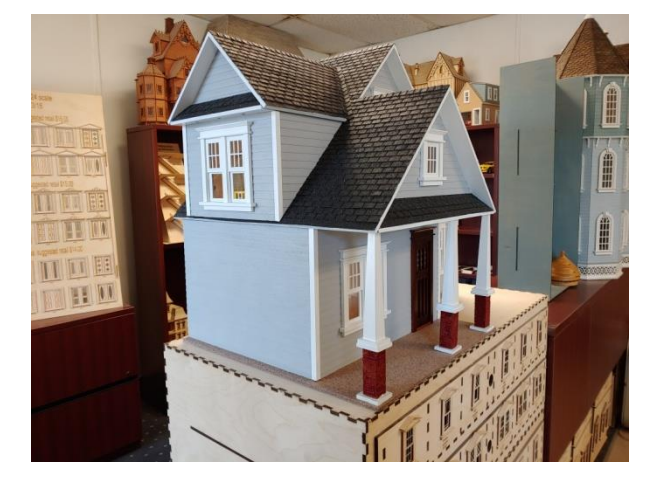
Figure 3 Figure 4