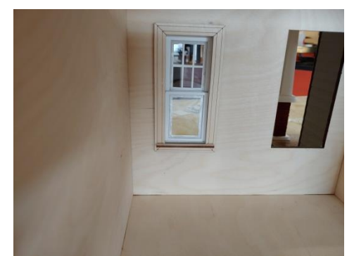
Figure 20 Figure 21 Figure 22