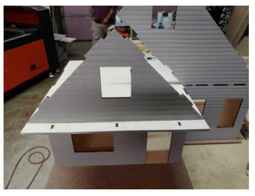
Figure 6 Figure 7