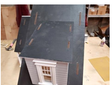
Figure 42 Figure 43 Figure 44 Figure 45