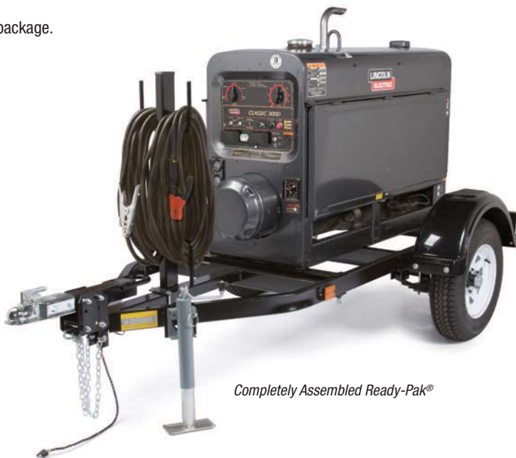
Completely Assembled Ready-Pak®

K2387-3 Classic® 300D Kubota® Ready-Pak® Package