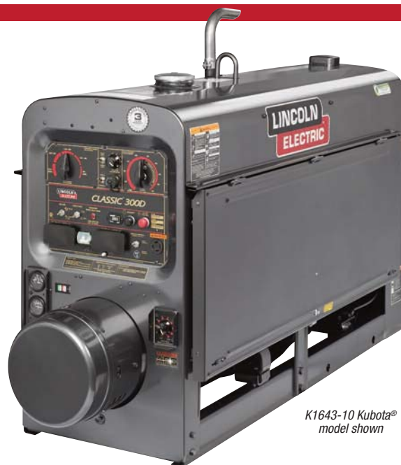
K1643-10 Kubota ® model shown