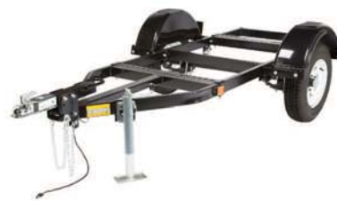
K2636-1 Medium Welder Trailer