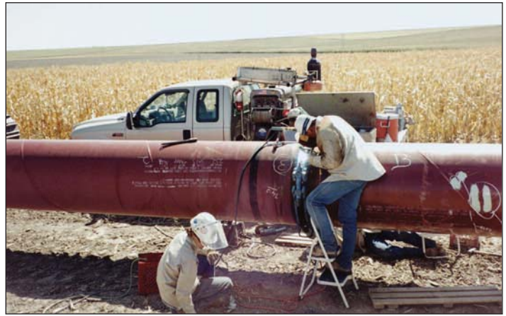
Cross-country pipe welding with Classic® 300D.