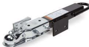
Duo-Hitch™ 2 in. (51 mm) Ball/Lunette Eye Hitch (included)