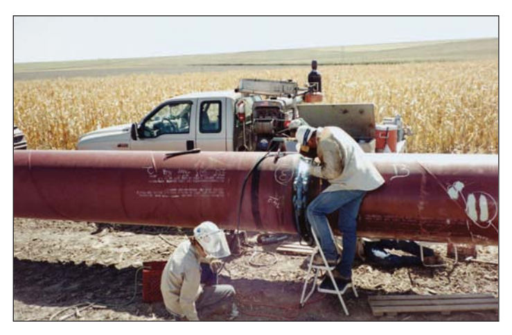
Cross-country pipe welding with Classic® 300D.