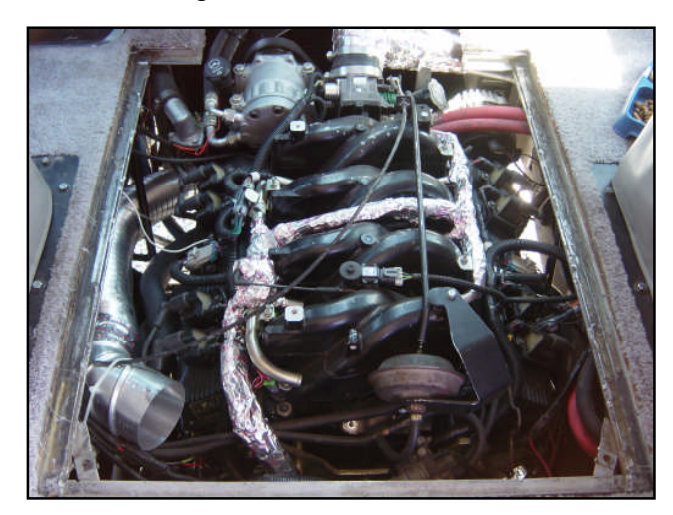
Engine Source: DynoSource Motors in Sequim, WA: www.gmccoop.com/dyno_source_motors.htm

The engine management (computer) operating parameters have been modified from those used in the marine application; however, like in the marine application, the engine makes maximum torque very low in the RPM band - a highly desireable feature in a GMC Motorhome.