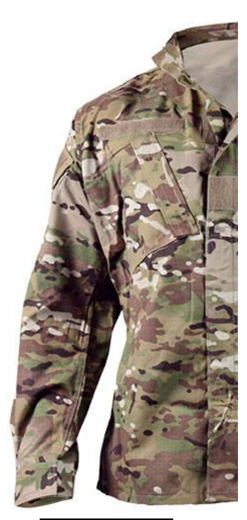
Back to Main