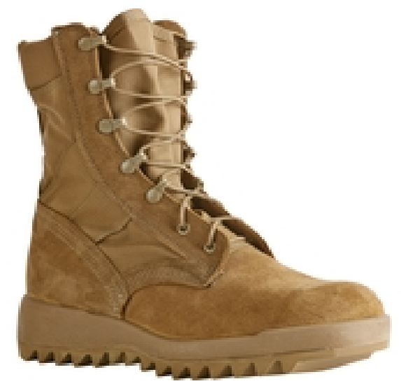
Coyote Boots will be worn with the OCP Uniform