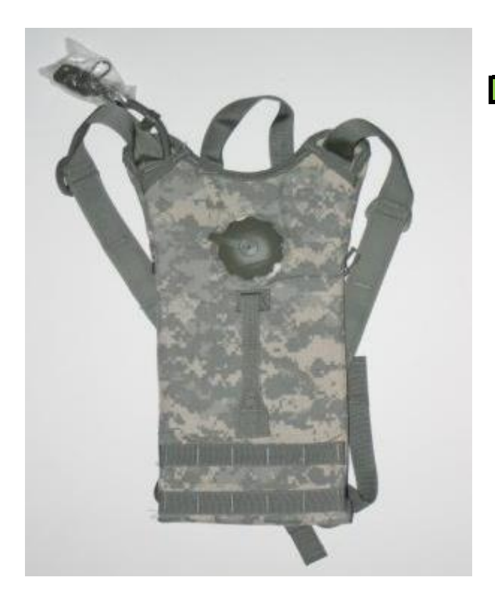
Tactical colors. ACU, BDU, Green, Black.