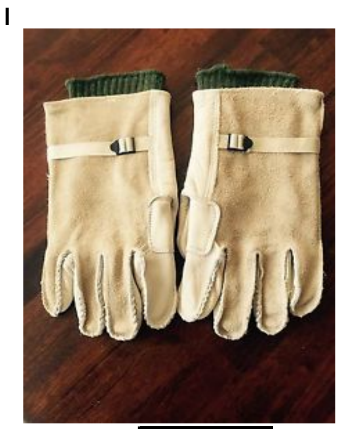
Back to Main