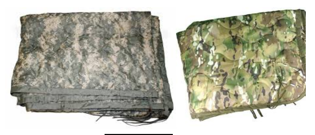
Back to Main