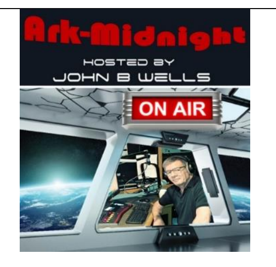
Ark Midnight airs live in over 30 markets including Dallas, Detroit, Denver, Seattle, Las Vegas, Houston, St. Louis and Chicago.