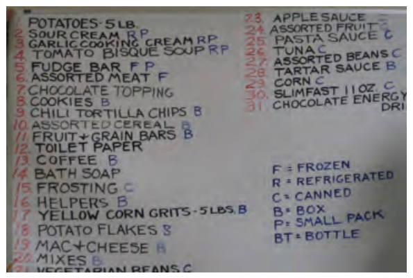
CHOICE ITEM SELECTION BOARD