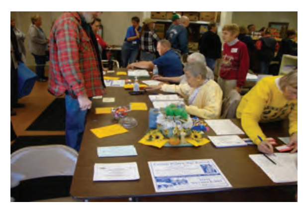
CLIENT INTAKE STATION

Loaves and Fishes in Carroll County is an example of a Table Model Client Choice Pantry. Loaves and Fishes is a large pantry totaling 900 square feet, and they serve 250 to 300 clients each month.