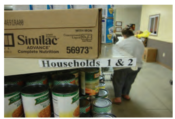
CHOICE ITEMS FOR A FAMILY OF 1 OR 2