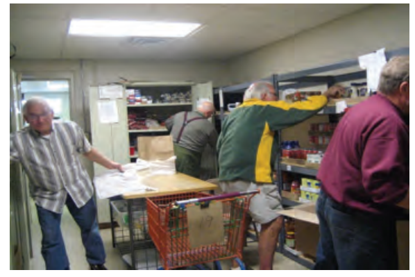
VOLUNTEERS FILLING CLIENT'S CHOICE ITEM SELECTIONS