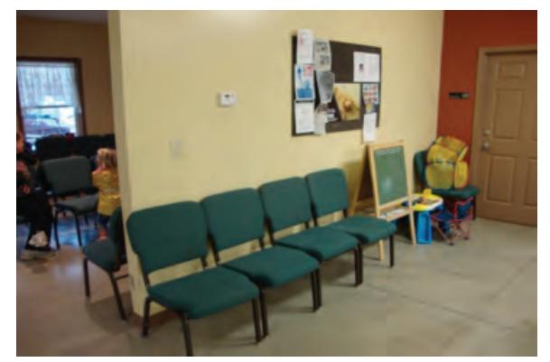
CLIENT WAITING AREA

The Love Center Food Pantry in Holmes County is an example of the Supermarket Model Client Choice Pantry. The Love Center is an extra large agency serving approximately 2,300 clients each month, and their facility is 4,000 square feet, which includes storage space.