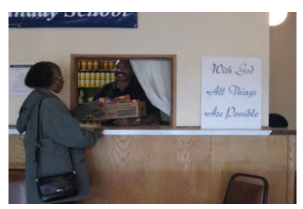
CLIENT PICKING UP GROCERIES