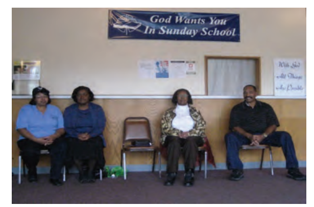
CLIENT WAITING AREA