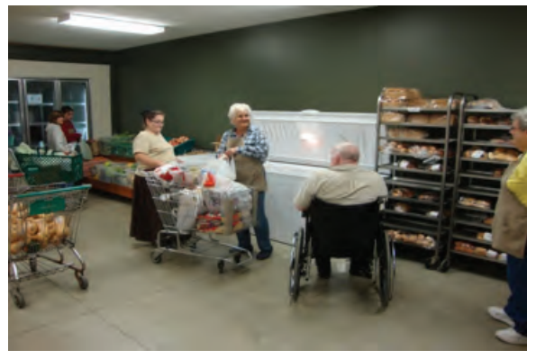
FROZEN FOODS & BREAD SECTION