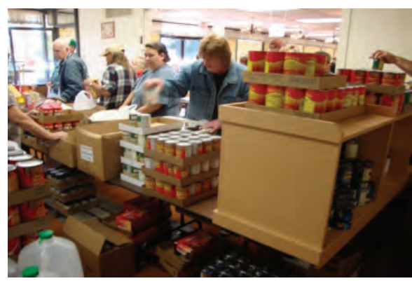
CLIENTS SHOPPING FOR CANNED FOOD CHOICE ITEMS