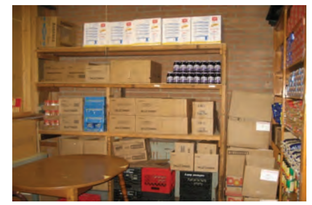
FOOD STORAGE AREA