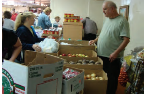
CLIENTS SHOPPING FOR PRODUCE CHOICE ITEMS