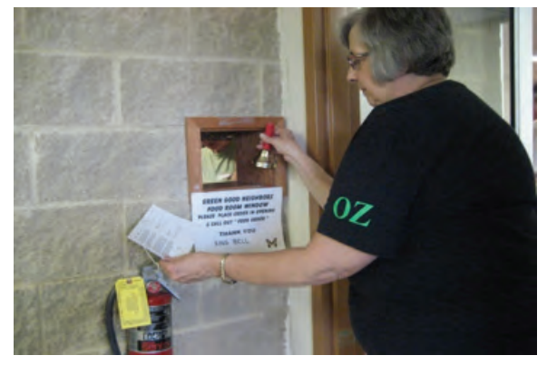
CLIENT SUBMITTING CHOICE ITEM SELECTIONS