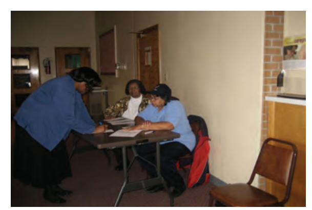
CLIENT INTAKE STATION