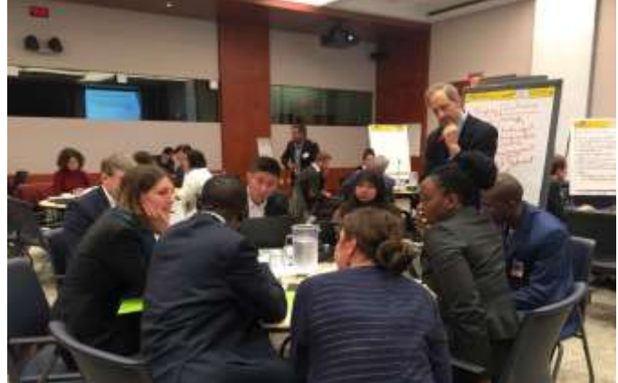
FIGURE 5: TCLP PARTICIPANTS AT THE FOURTH LEARNING WORKSHOP

The multi-stakeholder, multi-disciplinary makeup of the TCLP was key to the success of learning and socialization of the results. Overall, participants responding to the survey and those interviewed provided a positive characterization of the make-up of the TCLP and