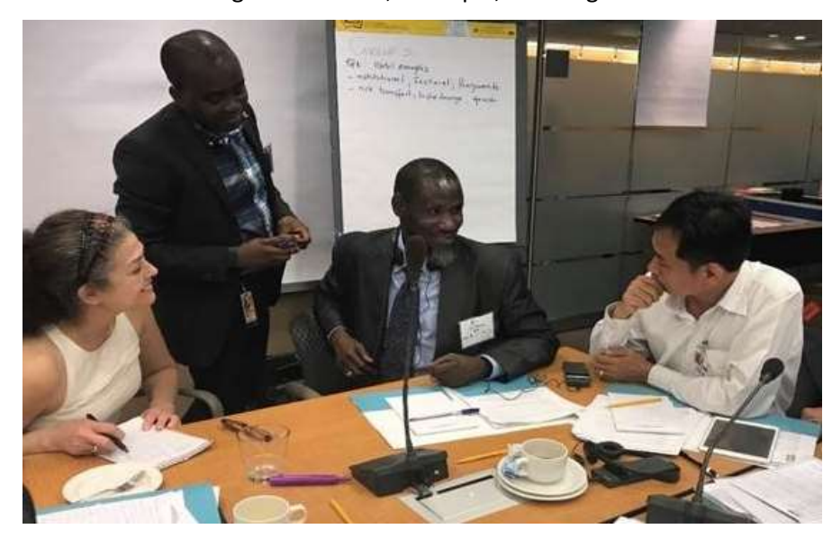
FIGURE 3: TCLP PARTICIPANTS AT THE FIRST LEARNING WORKSHOP

An important component of the first year of work was undertaking a preliminary portfolio analysis. The portfolio analysis included detailed desk review and analysis of CIF and MDB information sources for selected investments funded by the four CIF programs. The portfolio analysis examined 32 CIF country and regional programs associated projects, reflecting about half of the country programs in the full CIF portfolio. It focused on those with more implementation experience.9 The portfolio analysis was completed in early 2018 and helped inform both the