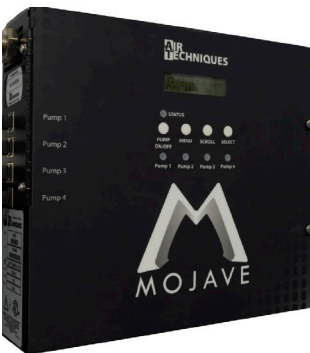
Mojave Master Controller