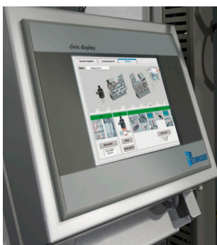
Programmer Logic Controller

The vacuum motors are turned on and off automatically by sensors that detect operational times and required volume flow. This ensures that electrical energy is used effectively and economically. The programmable logic controller ensures consistently uniform use of the vacuum system, thereby increasing its overall service life and reliability. An electrical and mechanical auxiliary air valve provides additional cooling for the motors and consistent power.